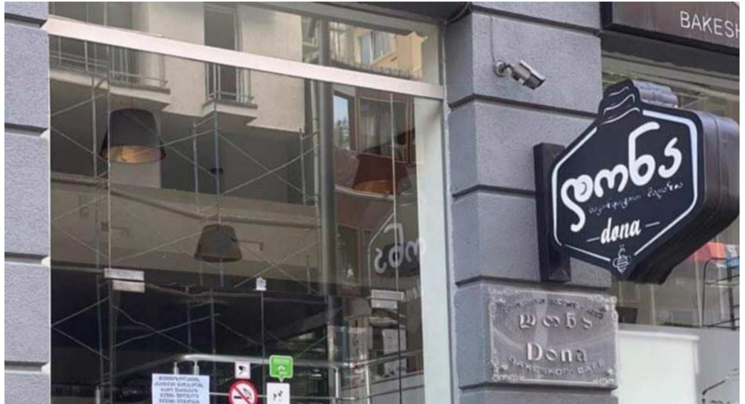
► Employees as well as the owner of Dona Bake Shop tested positive for COVID-19.