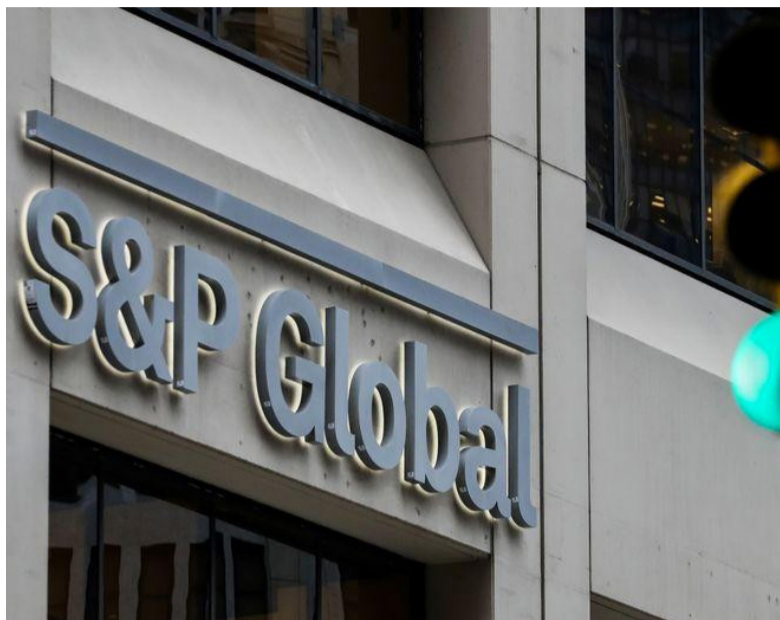
► One of the largest Big Three credit-rating agencies, S&P Global Ratings (previously Standard & Poor's) is an American credit rating agency and a division of S&P Global that publishes financial research and analysis on stocks, bonds, and commodities.

The rating company forecasts that the economic contraction in 2020 will result in 6% as a result of preventive measures taken against the spread of the coronavirus. The pandemic has done the most damage to the tourism sector, which is an important employer, a significant source of