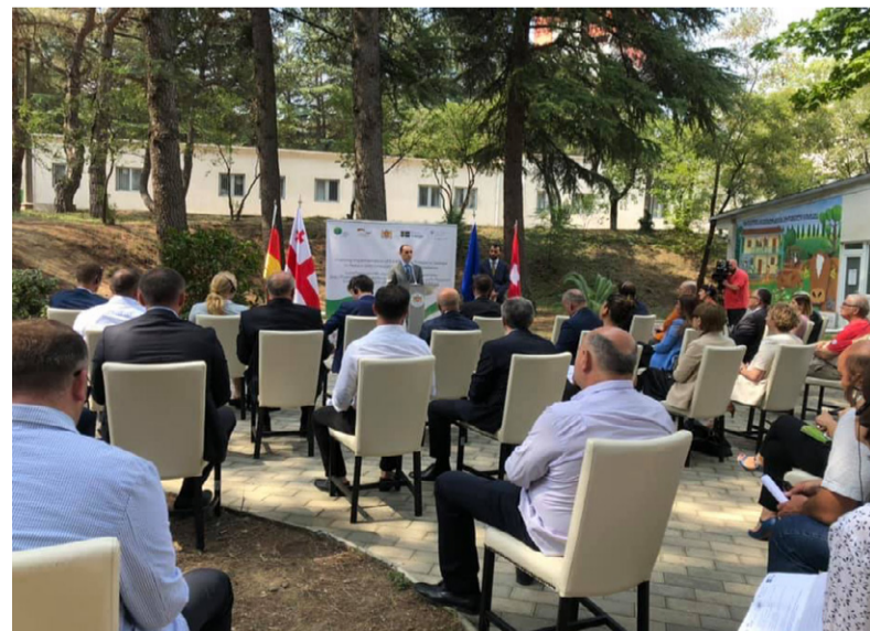
► Local governments as well as the ambassadors of Germany and Sweden attended the presentation.

strengthen and steps will be taken to improve the forest ecosystem. Davitashvili told the audience that it is a priority of the ministry to rebuild degraded forests and improve the ecological condition