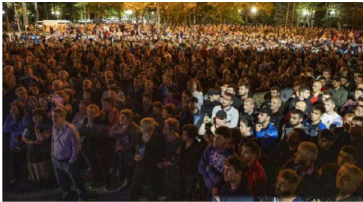
► Protest rallies in the so-called occupied Tskhinvali were followed by the resignation of the government.