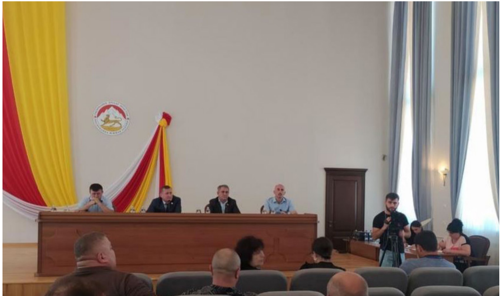
► The so-called Opposition lawmakers say they will not continue working in the de facto parliament until the so-called interior minister and prosecutor general is held accountable.