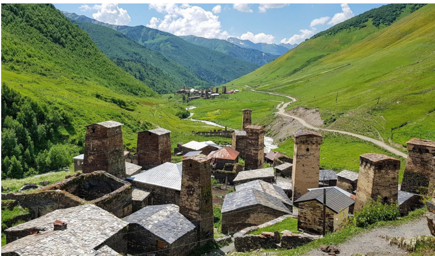
► Mestia, Svaneti region.

On September 2nd, the highest rate of COVID-19 cases has been recorded since April. 38 new cases have been confirmed. Gamkrelidze stated that in up to 15 cases, the source of the infection is unknown. In total, out of 1548 confirmed cases, 1270 patients have already recovered. Unfortunately, 19 people died from COVID infection.