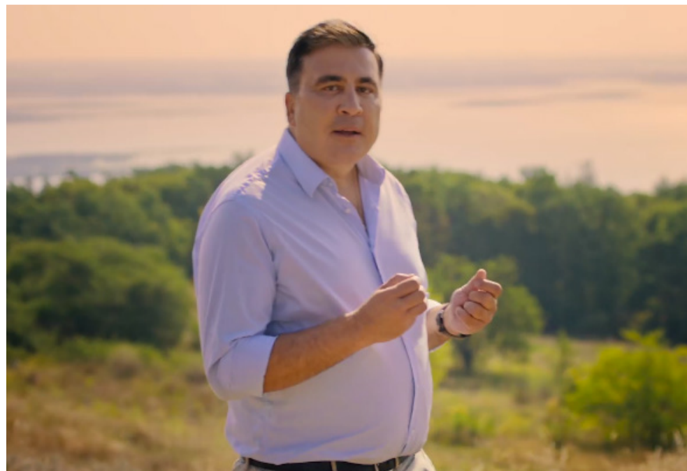
► In the newly released video Saakashvili apologizes to the public for his mistakes and says that now, years later, he knows how to serve Georgia better.