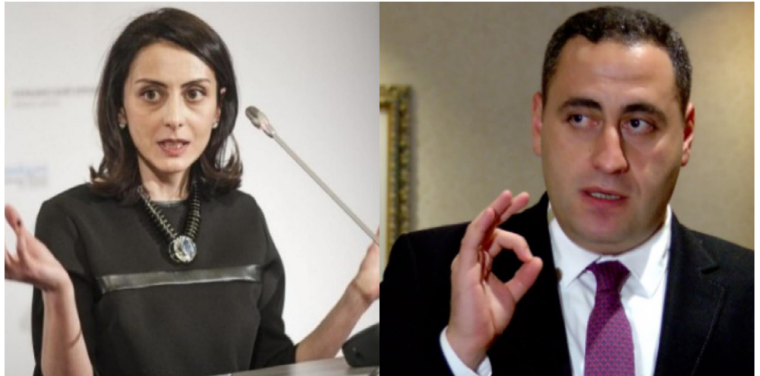
► Khatia Dekanoidze stated on the social network after being nominated that she does not need winning elections for power.

Dekanoidze explained that if Vashadze remained in the united opposition, he would be the agreed candidate of the opposition, but now, the political reality has changed and the UNM has nominated its candidate.