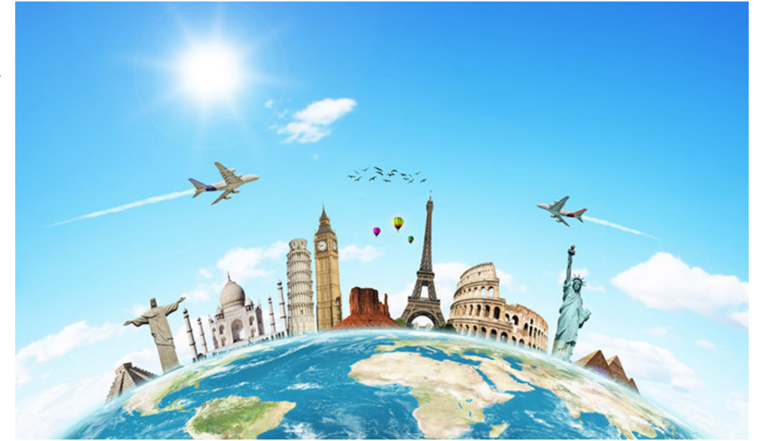
In July 2020, the total number of 45,842 visits made by international visitors to Georgia was 94.8% less than the same period last year.

Along with the sharp decline in trade in services, a decline in trade in goods is also expected. In parallel with reduced consumption and private investment, it is expected that the imports of goods will be significantly reduced. Due to similar