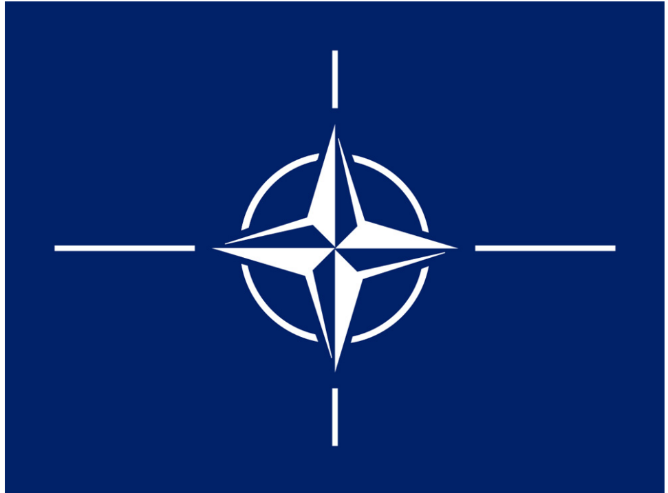
What will make it easier for Georgia to join NATO when the Russian army continues to occupy 20 percent of the country?

Georgia is a strong partner of NATO and a particularly strong partner for the United States. Georgia's economy, like all other countries' economies, faces challenges. However, the fundamental factor, which is human capital, is extremely high in Georgia. It is a small country with great potential that has a bright future ahead, despite the difficulties it has faced in the last 12 years since the Russian invasion.