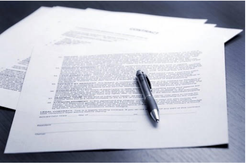
The declaration was elaborated on August 18th.

parties state that the declaration will be somewhat prevention of rigging the elections.