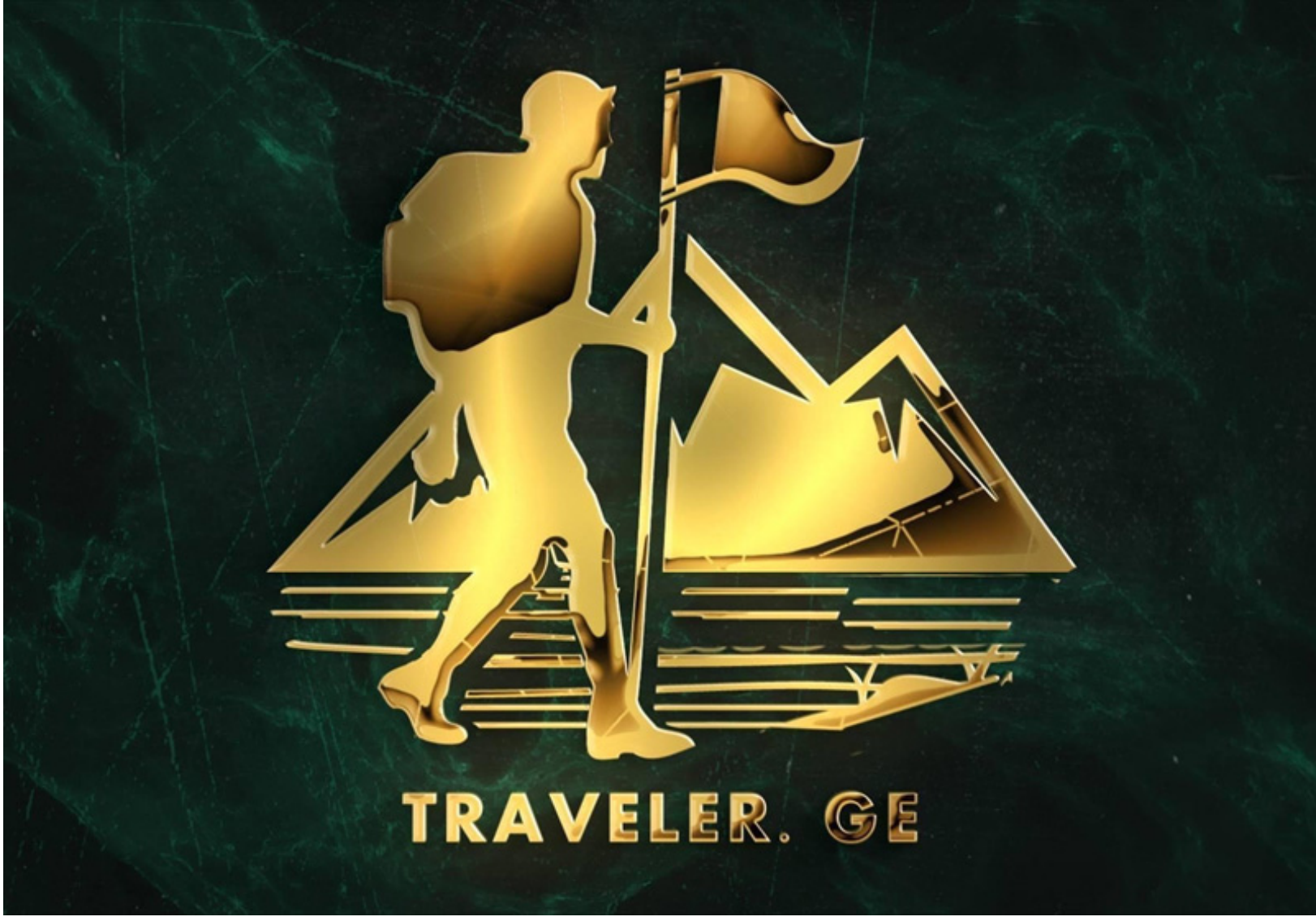
The employees of the travel agency Traveler.ge have already been questioned.