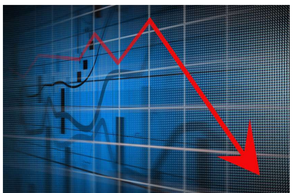
In the first half of 2020, the Georgian economy shrank by 5.8%. The decline in the second quarter was -12.6%.

developments in the world, it is expected that the demand for exports will decrease and, consequently, the volume of exports of goods will decrease.