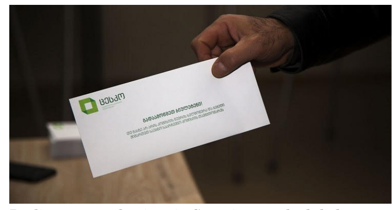
Parliamentary elections in Georgia are scheduled on October 31^{\rm st} .

"Up to 30 opposition parties, the majority, agree to protect each-others votes. This is a very powerful political signal about the unity of the opposition."