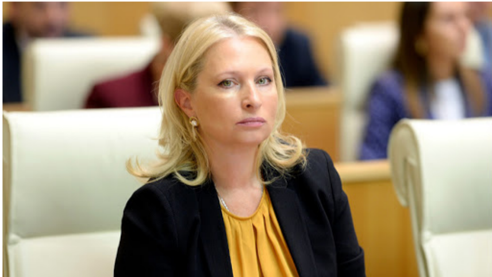
Turnava said Georgia will make decisions according to the Covid-19 situation in Russia.

government will consider it depending on the epidemiological situation.