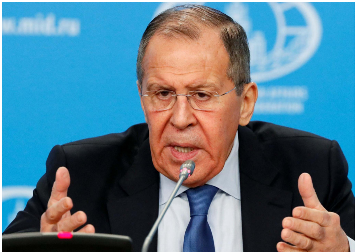
Georgia has suspended regular flights to almost all countries due to Covid-19 pandemic.

According to the Minister of Economy, if there is any proposal from Russia regarding resuming flights, the Georgian