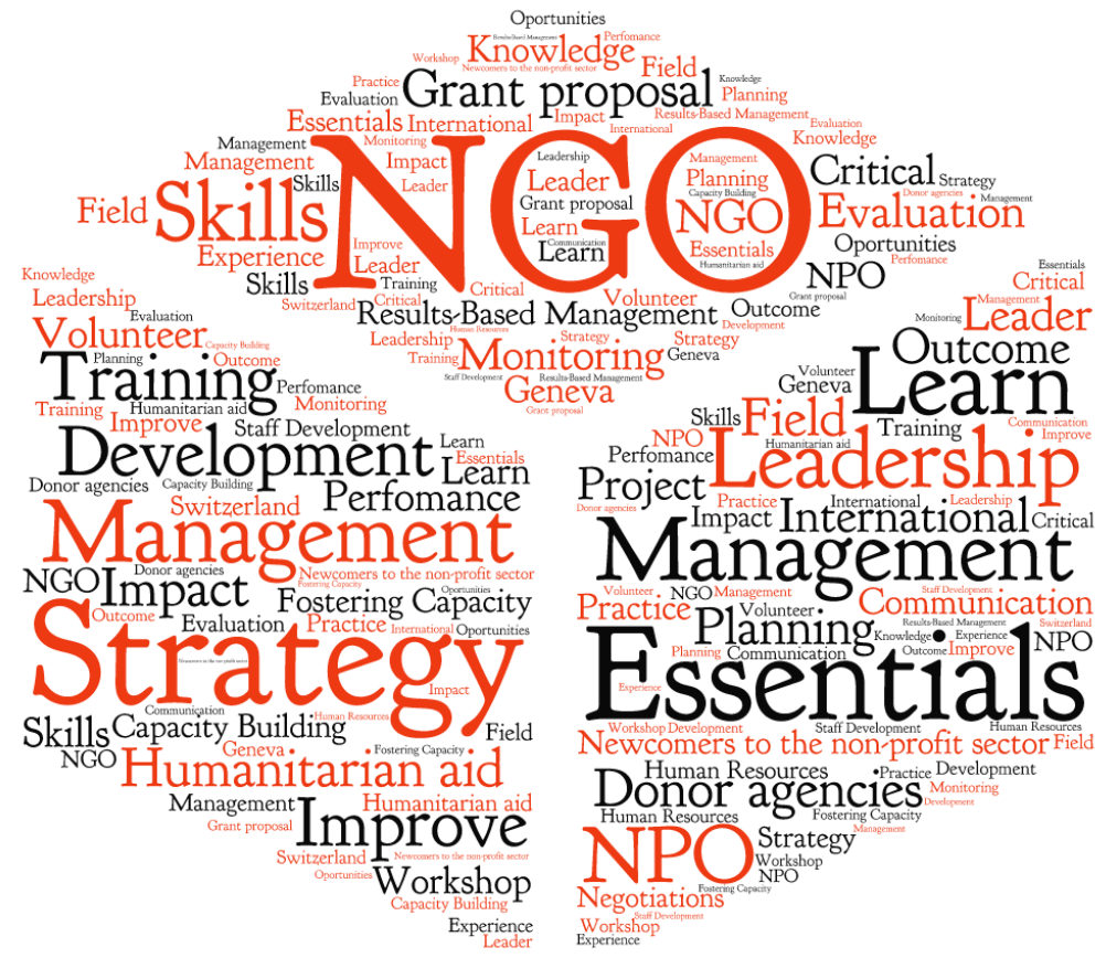
NGOs call on the government to step up aid to the occupied region of Abkhazia and South Ossetia.

To deal with the pandemic, the Georgian government and international organizations regularly provide medical equipment, medicines and hygiene items to the Abkhaz region. People infected with coronavirus are being treated in the controlled territory of Georgia. In particular, since the outbreak of the pandemic in the occupied Abkhazia, four patients, including two from the medical field, have been transferred to the central government-controlled area for treatment. One of them has already recovered while three are undergoing treatment. A field hospital has been opened near the Enguri Bridge, where local doctors measure fever for each patient from the occupied territories and transfer them to various medical facilities according to complaints. In order to treat infected patients, the Gray Hospital was equipped and started work to build easier access to free medical care for the people living in the occupied territories. According to the agency, up to 1,000 people have left the occupied territories controlled by the central government since March 22nd, of which 316 patients in need of emergency medical