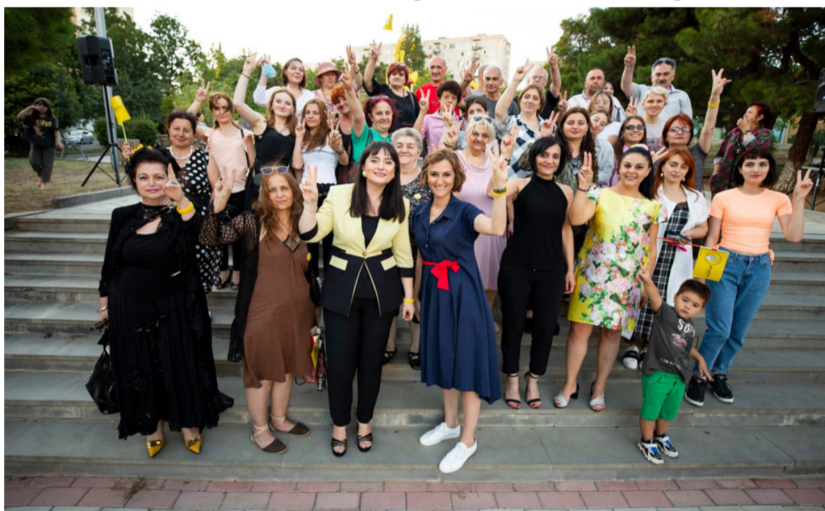
Lelo for Georgia is a political party in Georgia that was created at the end of 2019.

They are representatives of different social statuses. One of the main goals of Lelo will be to strengthen the role of women in politics and social life in general. We want to empower them financially and socially, so that they can be successful on their own," said Galdava.