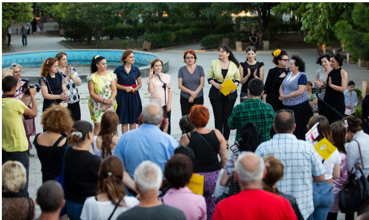
The aim of the Women's Council is to strengthen the role of women in politics.

"Today, we have presented 12 new members of the Lelo Women Council. These are the women who came to the Lelo office on their own and showed their desire to become part of our political party.