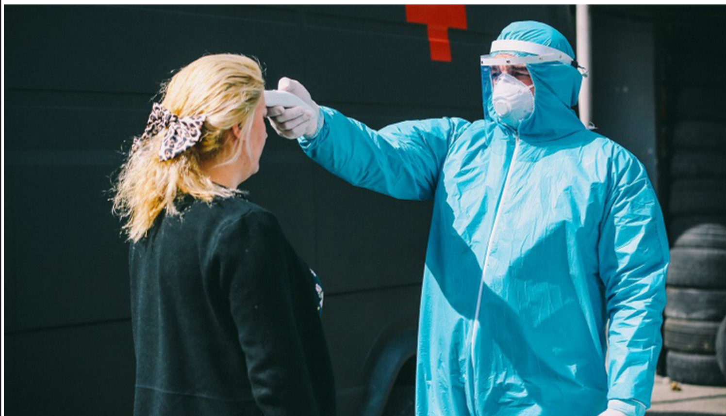
15 new Covid-19 cases have been reported in Georgia.