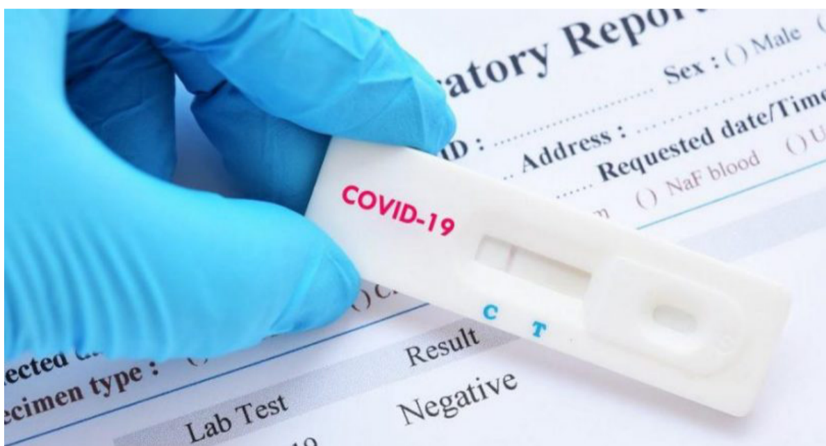
More than 21 million Coronavirus cases have been reported around the world.

The number of people who died from the virus reached 770,000. More than 14 million people have completely recovered. Most cases of Coronavirus are reported in the United States, Brazil, India, Russia, and South Africa.