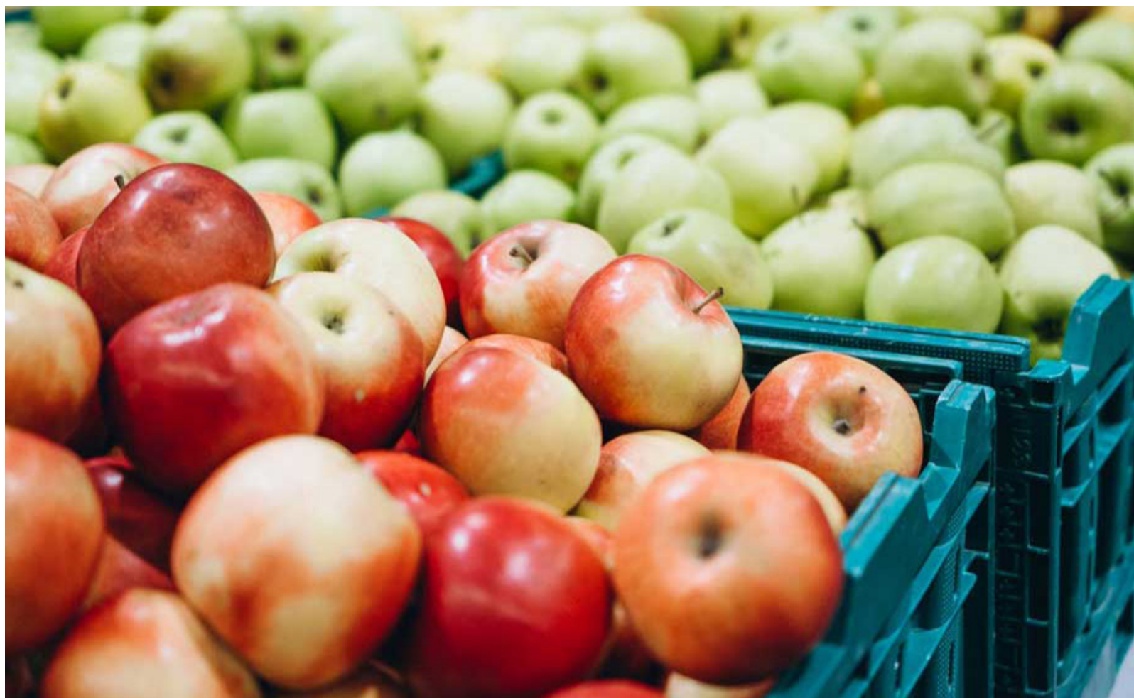
► Ministry of Agriculture Releases Information on Non-Standard Apple Procurement Subsidy Project.

However, the monetary policy report states that in March of this year, the number of international visitors continued to decline in the second quarter due to restrictions on international air traffic and closed land borders. Overall, the number of international visitors decreased by 94.3% year-on-year in the second quarter. Amid the declining number of visitors, revenue from international travelers fell 96.7% year-on-year in the second quarter of the year. It should be noted that, like the number of visitors, revenues from international travelers are expected to