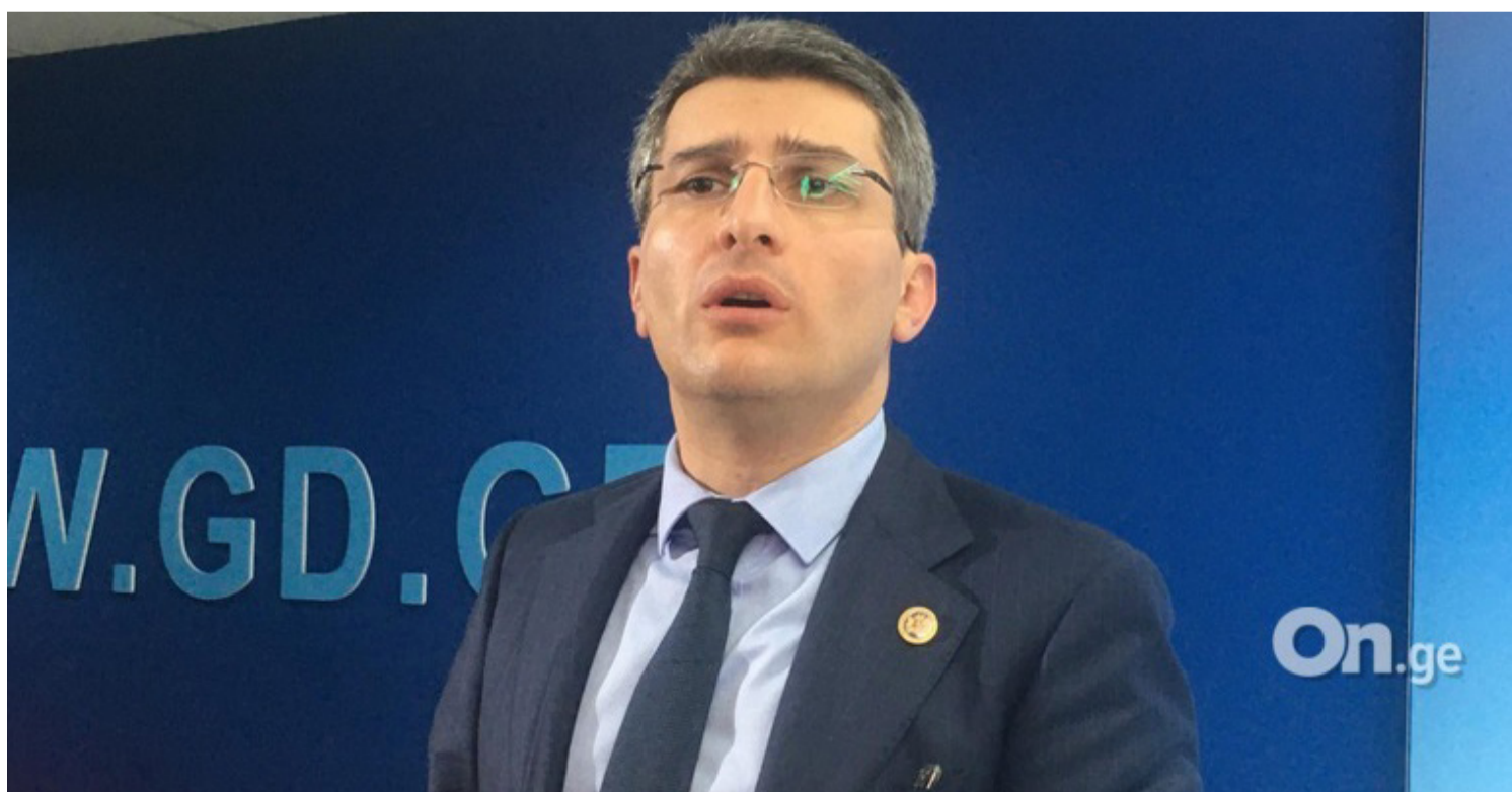
► Mdinardze says Rustavi 2 poll is closest to reality.

One month before the publication of this research, on July 16, Formula TV also released the data of the research commissioned by it. According to an Edison Research poll, 39% of respondents supported the Georgian Dream, 16% supported the United National Movement, and 3% supported the European Georgia and the Free Democrats coalition. 20 percent of citizens had not yet decided who to vote for.