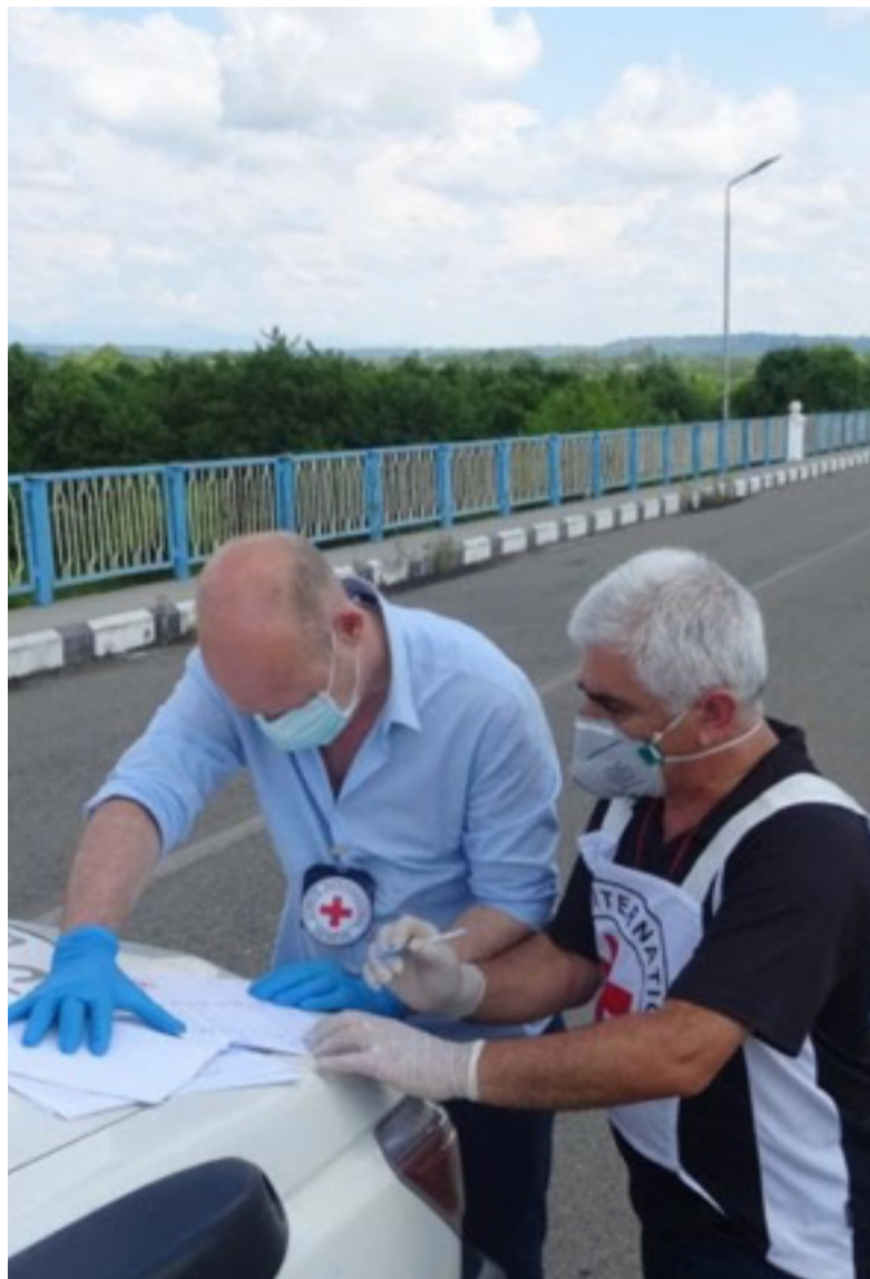
The Red Cross-platform is humanitarian only and acts on behalf of the families of the missing.