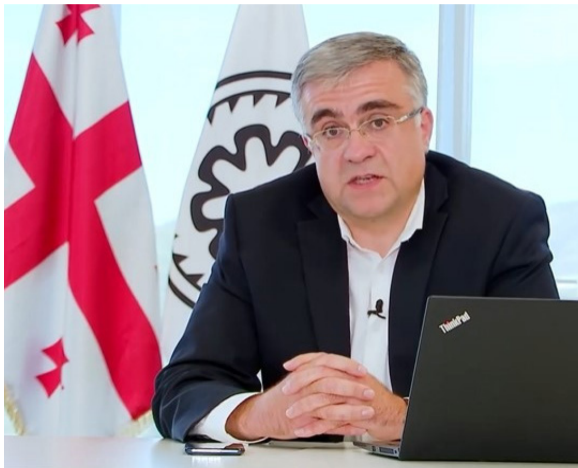
► According to the NBG, the drop in imports was caused by the decline in tourism and forecasts in this regard.

"This means that as the customs clearance will be postponed, the fines will not be charged. This will apply to approximately 24,000 car owners and this is approximately a tax relief of more than 30 million," said Gakharia noting that it is necessary to help car importers and avoid these necessary daily expenses, especially during the crisis.