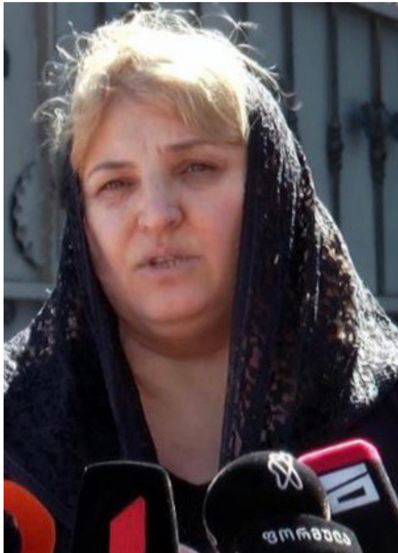
► The mother of the deceased rules out suicide.