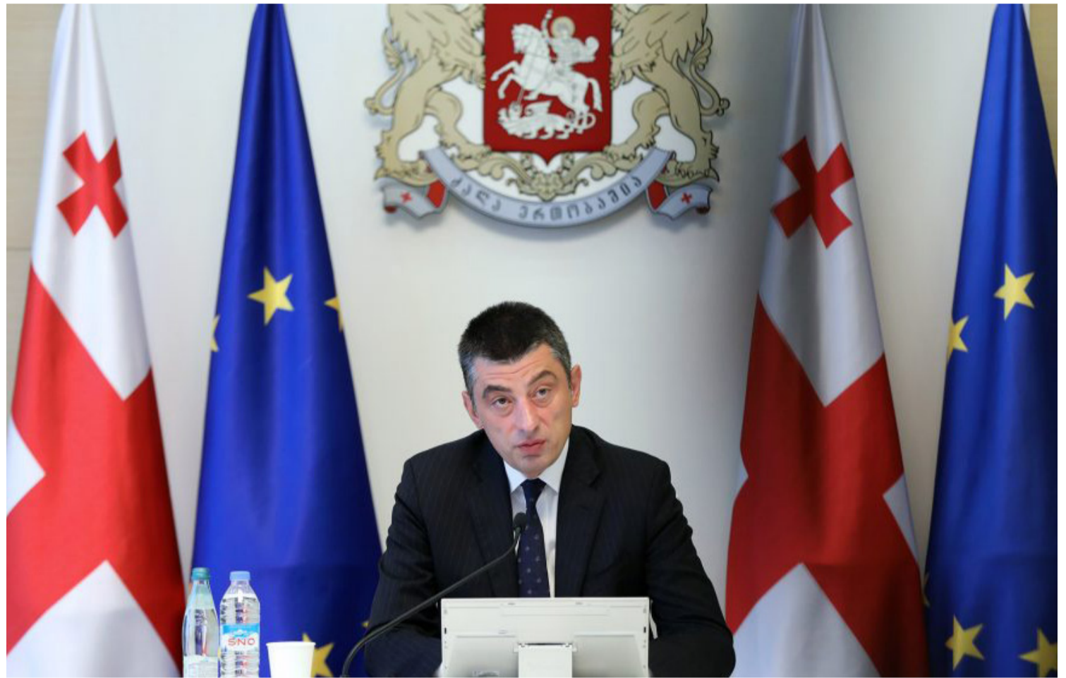
► "Believe me, if this continues, we will have to announce another social package at the beginning of next year," PM commented, concerning the economic crisis fueled by the Covid-19 pandemic.