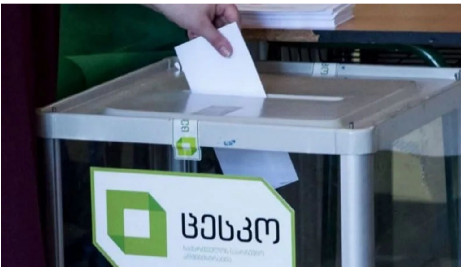
Elections 2020 will be held with a new electoral system