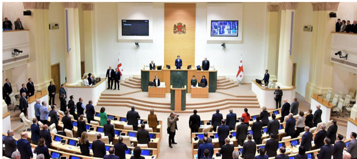
The elections should be held on October 31 st

thought about being a majoritarian MP. This is how he answered the media question whether he will be the Zugdidi majoritarian candidate.