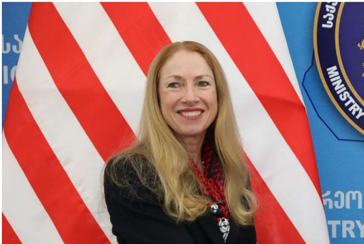
Ambassador noted that the USA supports Georgia's democratic development

She also added that this is a very important message and should be taken seriously. On the one hand, the congressmen want to see a successful and de-