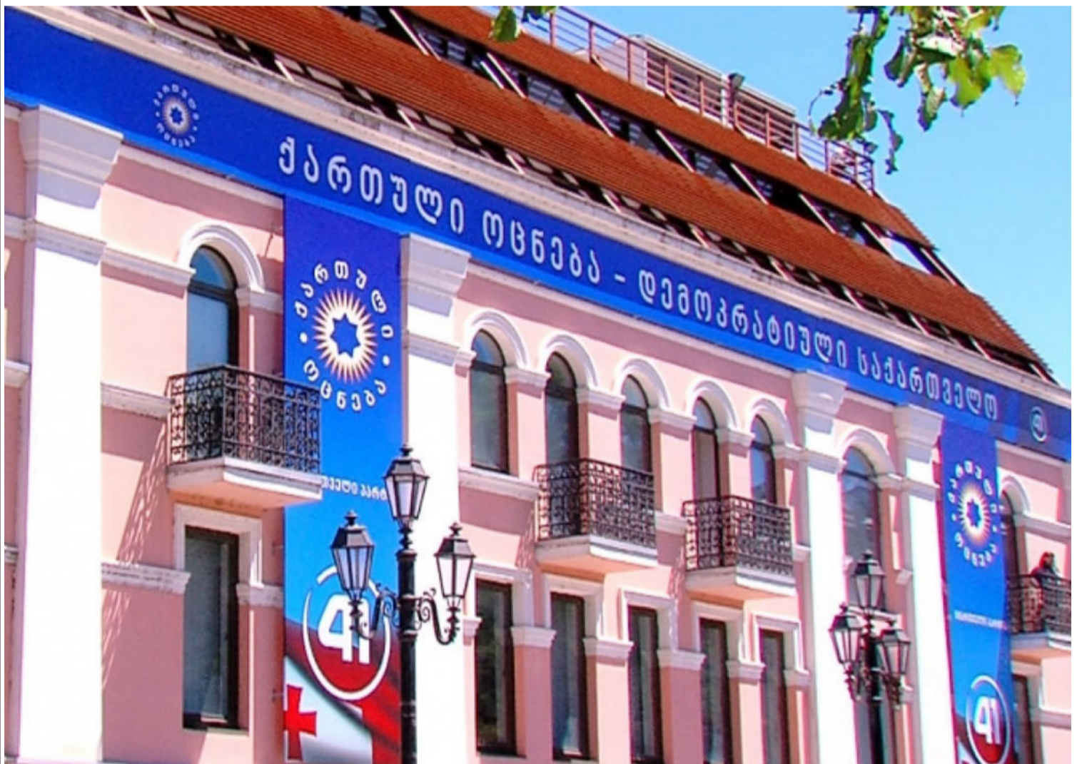
The ruling party will announce its list today