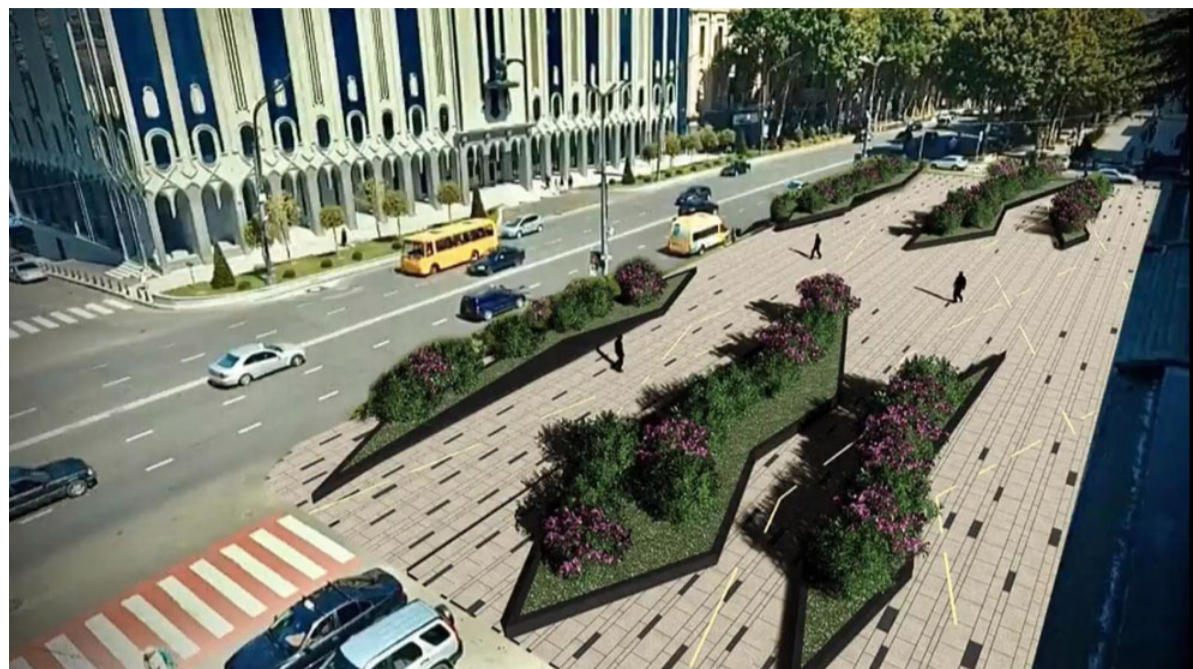
The mayor has shared the pictures on Facebook