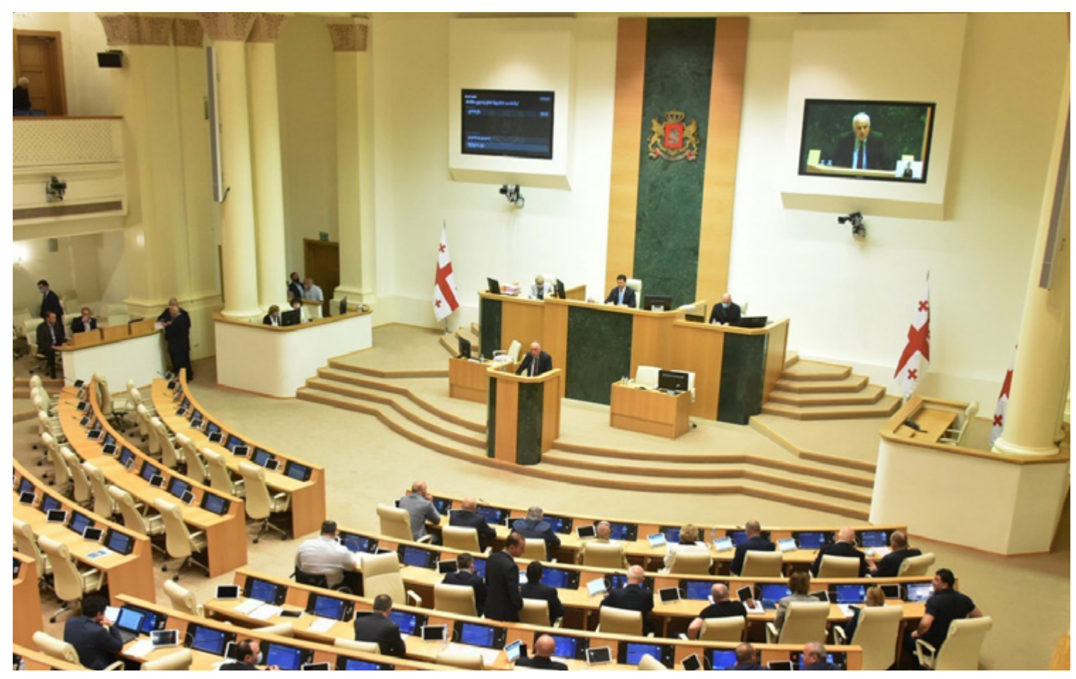
• Out of 100 deputies present at the session, 79 supported and 1 MP opposed it.