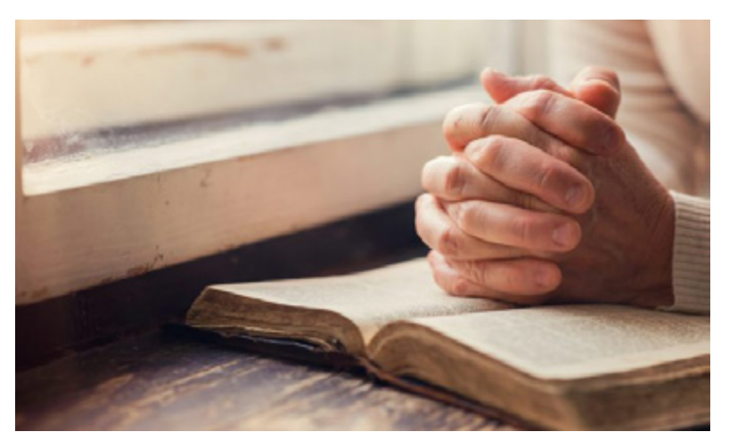
As TDI notes, this year, followers of Judaism faced a similar problem as the members of Seventh-Day Adventist Church

According to the statement, the request has not been satisfied by NAEC because "the schedule had been already approved." However, TDI states that the exams in English language are set on three different dates, July 17th- 19th, and since there is a possibility of switching exam dates for the mentioned applicants, considering the fact that they applied their request to NAEC on time, freedom of religion and belief