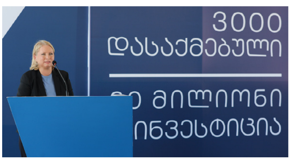
• "Beware of investors, enterprises, today they create products and employ people," Turnava says.

According to Turnava, when the world is fighting Covid-19, any investment is important,