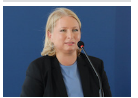
FULL STORY ON Page 3

New textile factory opens in Rustavi, aims to employ 3 000