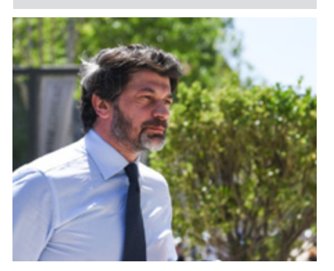
FULL STORY ON Page 2

City Hall offers free space to restaurants and clubs temporarily