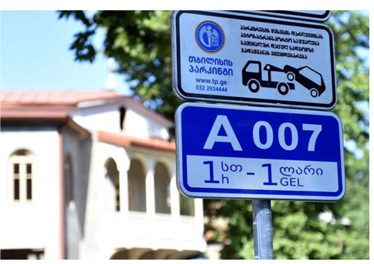
▶ The zone-hour parking system will be launched on Pekini Avenue.

Culture institutions and projects run in Georgia's capital will start benefiting from an increased financial support from the Tbilisi City Hall.