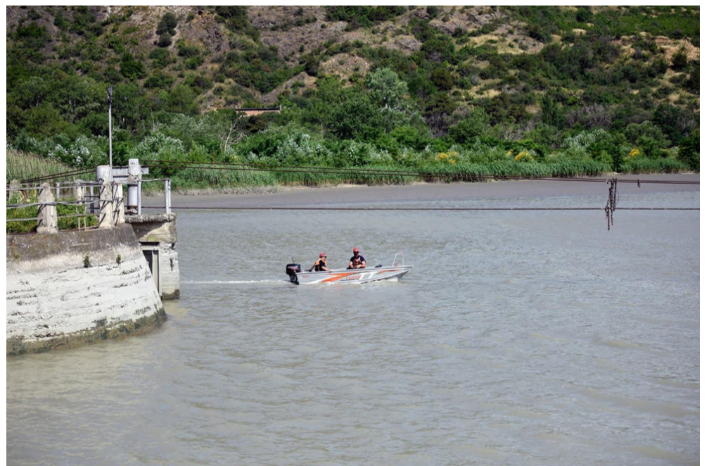
Shakarashvili's body was found in the river of Aragvi on June 22