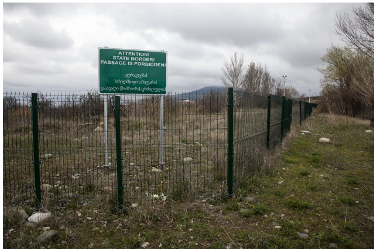
A 33-year-old man was detained by the occupying forces near the dividing line