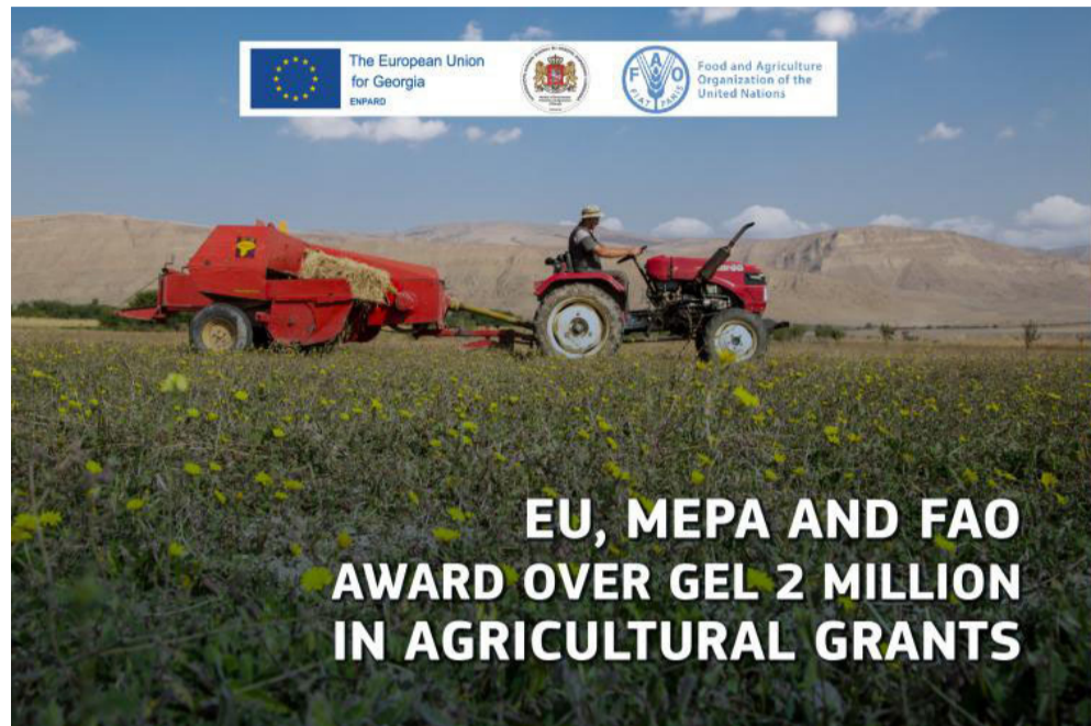
These investments are expected to have a catalytic effect as they target bottlenecks in concrete value chains

The European Union (EU), the Ministry of Environment Protection and Agriculture of Georgia (MEPA) and Food and Agriculture Organization of the United Nations (FAO) have awarded 35 matching grants with a total amount of more than ₾2 million, covering 40 to 75 percent of farmers' initial investments in