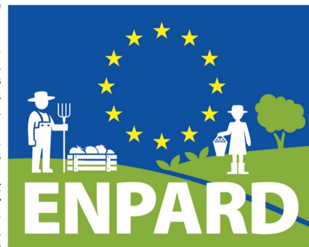
EUROPEAN NEIGHBOURHOOD PROGRAMME FOR AGRICULTURE AND RURAL DEVELOPMENT

The EU is supporting agriculture and rural development in Georgia through its ENPARD Programme