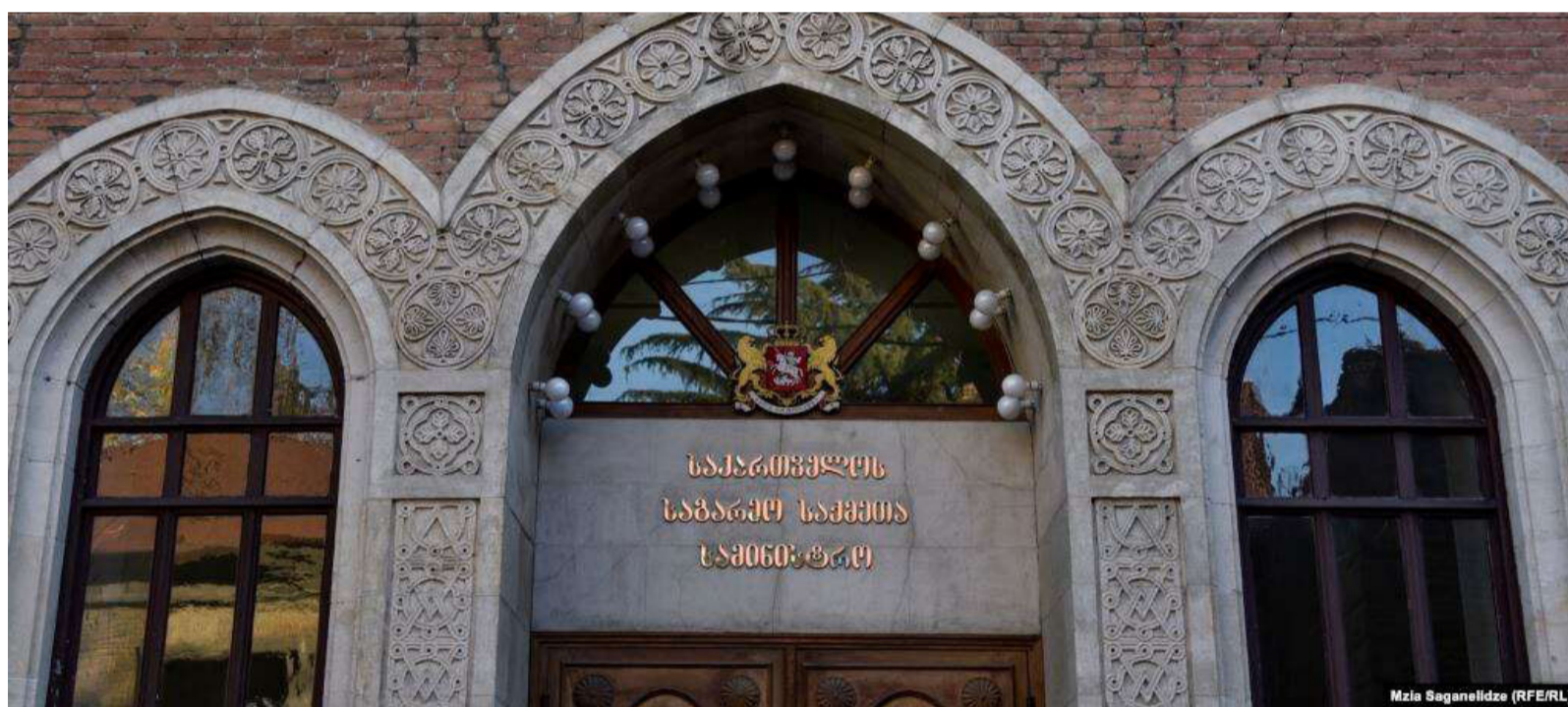
The Ministry of Foreign Affairs categorically demands the immediate extradition of a wounded and illegally detained Georgian citizen to the Georgian side

The 33-year-old man was detained by the occupying forces near the dividing line two days ago. Later, it became known that during the arrest the so-called guards opened fire, as a result of which Gakheladze was