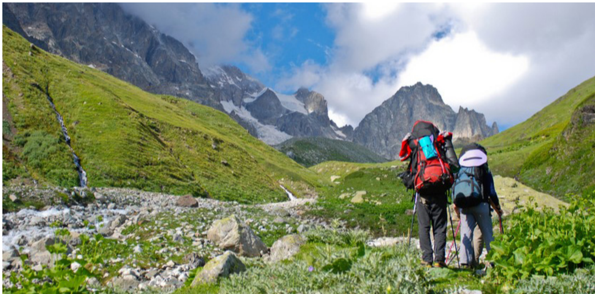
► Gakharia: "Let's discover Georgia and the places we have heard and read about, but we have never seen."

SUMMER SEASON OPENS IN MOUNTAINOUS GEORGIA