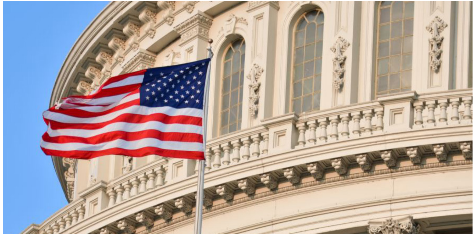
► The budget bill was approved by the subcommittee of the House Appropriations Committee on July 6 th . This time, the bill, with the criteria added and specified in it, has to be approved by the Assessment Committee.

and regulations; (C) to ensure that the rule of law in the private sector meets internationally recognized standards, including the right of foreign businesses to operate freely and without harassment, in order to fully realize the commercial and financial benefits of investing in Georgia.