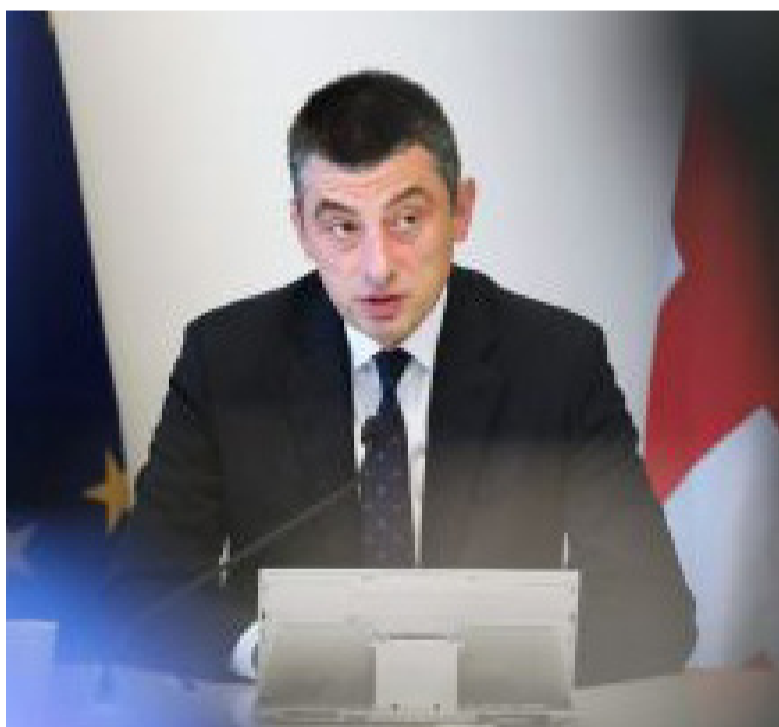
► "We are launching a new program 'Travel for Georgia' in connection with domestic tourism," PM announced.