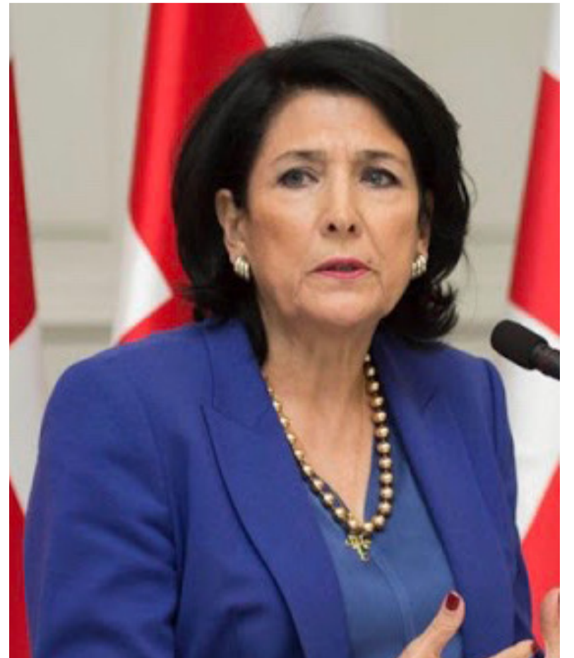
► The president of Georgia criticized the 28 year-old basketball player for his decision.

Despite all the support from his teammates, as well as the federation, he is still receiving criticism. The President of Georgia, Salome Zurbishvili, criticizes the former captain of the Georgian basketball team for joining the Russian team. The president posted her statement on Facebook.