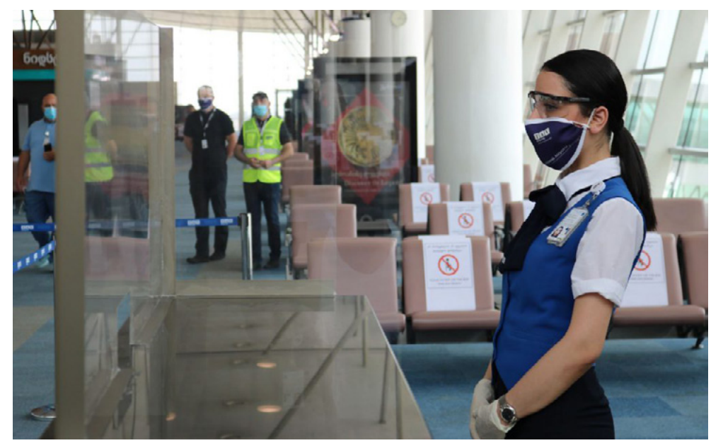
• Georgian Government announced it would open the borders for international tourism starting from July 1st, however the closure of the national borders was extended, with the regular flights being suspended until further notice.

Yesterday, 5 new cases of coronavirus were confirmed in Georgia. The total number has increased to 963. 3 more patients were cured of coronavirus. A total of 841 have recovered. As of the morning of July 8th, 107 patients are being treated. 3903 is in quarantine mode and 202 under hospital supervision.