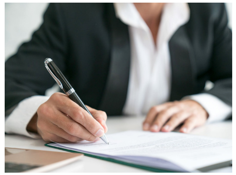
▶ the statement was signed by the following NGOs: Transparency International-Georgia (TI), Institute for Development of Freedom of Information (IDFI), Civil society Institute(CSI) and Green Alternative.

"Among others, financial assistance for Georgia in the amount of $132,025,000 is mentioned in the document. However, the withholding of funds is also indicated in the bill, according to which, 15% of financial assis-