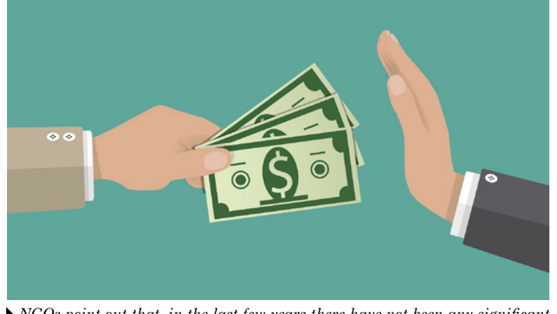
▶ NGOs point out that, in the last few years there have not been any significant reforms for fighting against corruption in Georgia and the progress in this direc-

According to the corruption perception index by Transparency International, in 2019 amongst 180 countries, Georgia was ranked 44th with a score of 56, which is a worsened index compared to last year. According to the corruption perception index, limited separation of powers, abuse of state