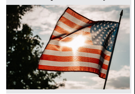
FULL STORY ON Page 2

US Embassy issued a special video in celebration of the Independence Day