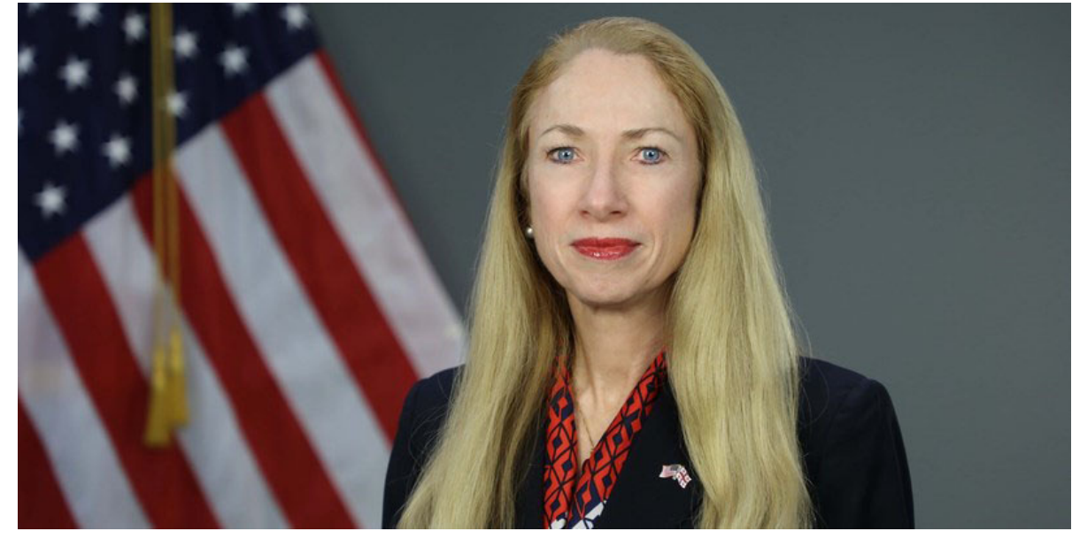
US Ambassador to Georgia talked about the importance of freedom and independence for American and Georgia people

"For almost three decades, the US has stood by Georgia's side. Together, we have overcome many challenges, marked important benchmarks, and celebrated joint accomplishments. Today, the world faces the challenge of our lifetime and as always, in the face of this crisis,