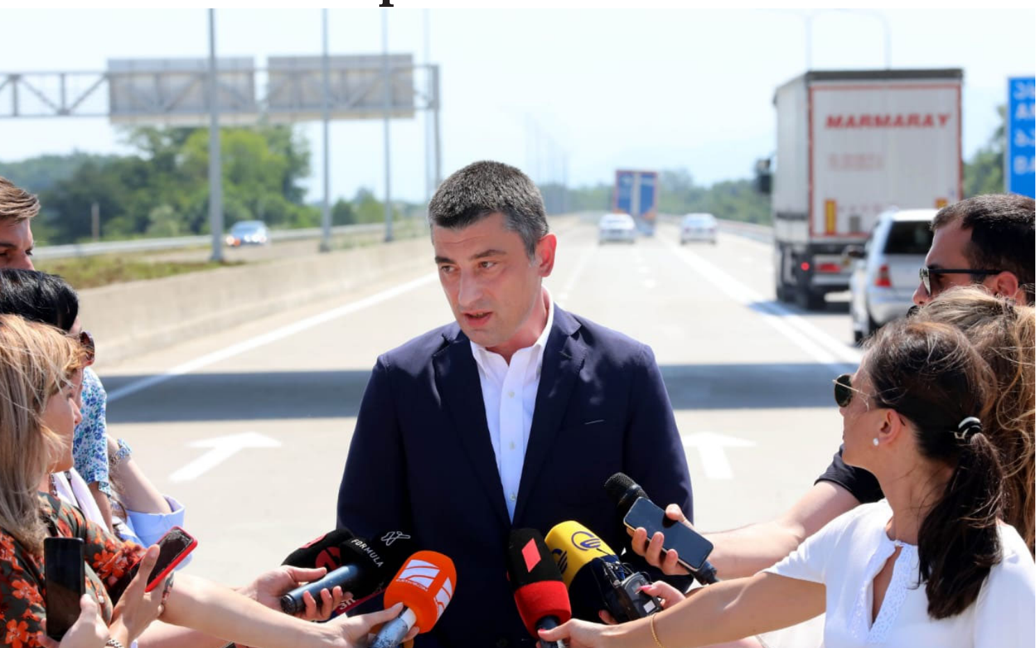
Gakharia talked about the electoral system

PM Gakharia: reopening borders is not possible for now