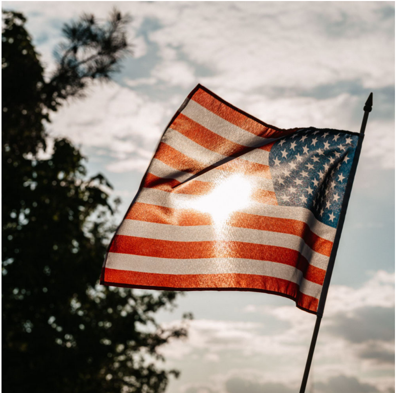
PM Gakharia issued a special statement

our American partners have offered us invaluable support, which we highly appreciate. We are very grateful for the United States' support and engagement in Georgia's fight against COVID-19 pandemic," added Gakharia.