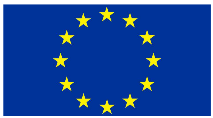
According to Gakharia, the main goal of the country is to become closer to the EU and NATO

as possible to the European standard in the coming years," said Gakharia.