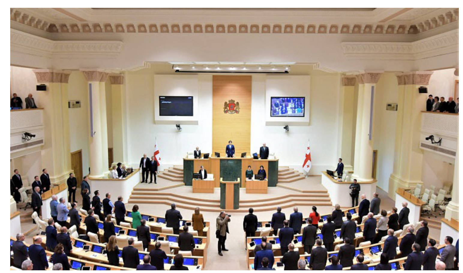
The new electoral system was adopted in the Parliament last week

He also said that the parliamentary republic and the proportional electoral system are among the highest characteristics of modern democracy. According to him, the main goal is for Georgia to become a full-fledged member of the European Union and NATO, for which the country will have to carry out many reforms and a great deal of work.