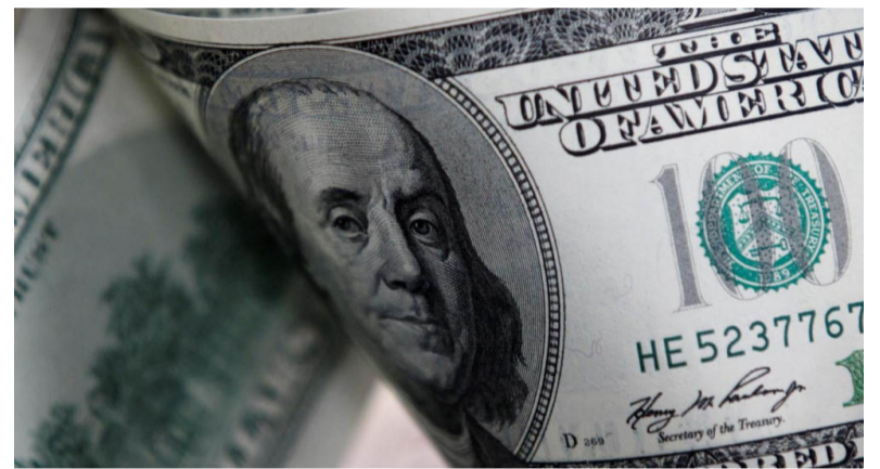
Italy, Russia and Greece were the largest remittance senders in Georgia in April 2020.