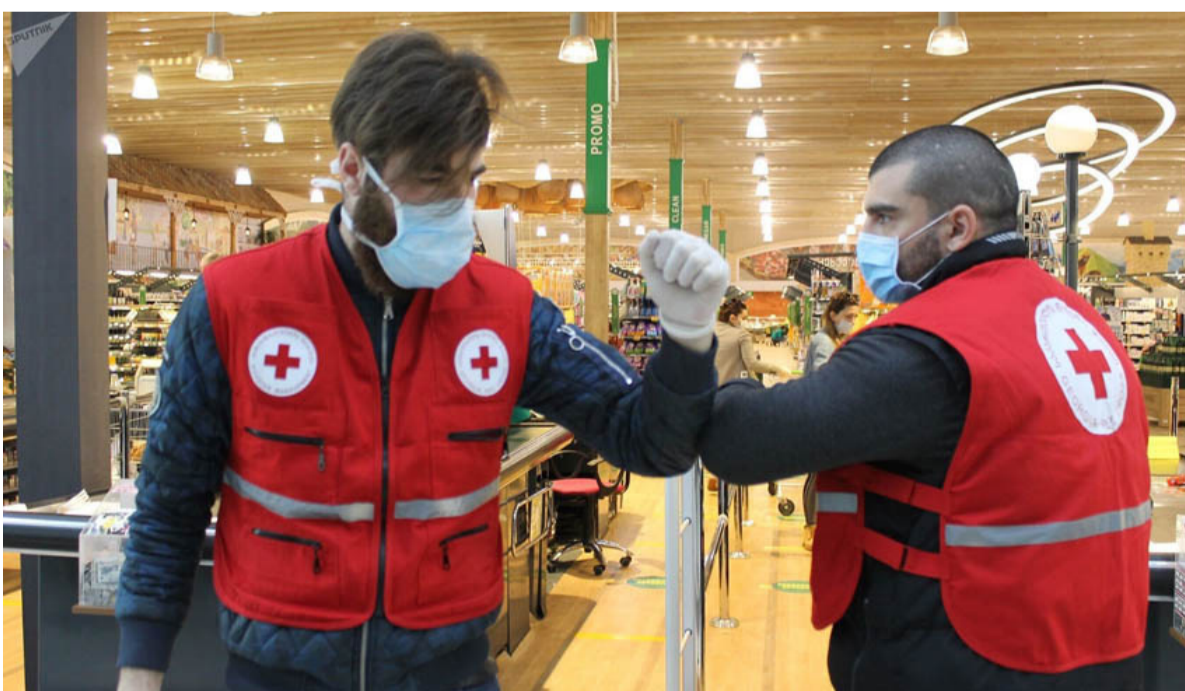
“GRCS will launch an online learning platform for home care staff, volunteers and informal caregivers, to equip them with the knowledge and skills needed to deliver professional and community-based home care,” reads the statement.