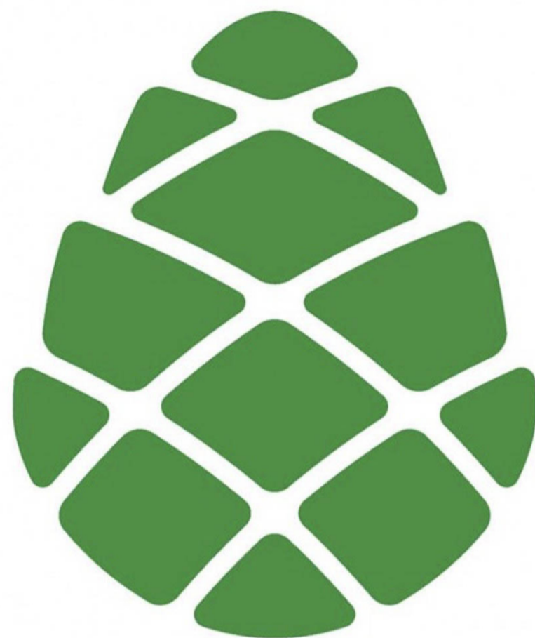
The statement signed by opposition parties, including Girchi.

ous Georgia, European Democrats, Christian-Conservative Party, Civil Alliance for Freedom, Free Democrats.