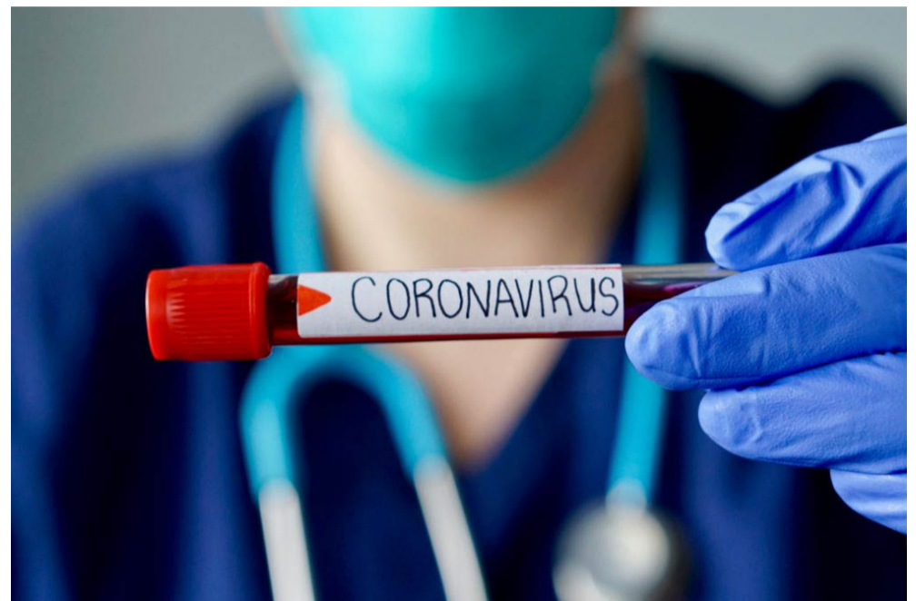
There is only one reported coronavirus case and 8 recoveries on the 8 th of June.

As of June 8 th , only one new case of the Coronavirus has been reported and 8 patients have recovered. Overall, there are 810 cases, with 683 recoveries and 13 deaths. 2915 citizens are quarantined and 237 are hospitalised.