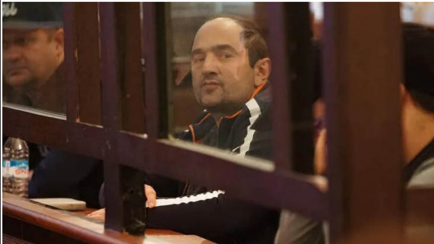
Opposition urges gov't to 'fully abide by' election agreement, release TV co-founder Rurua.