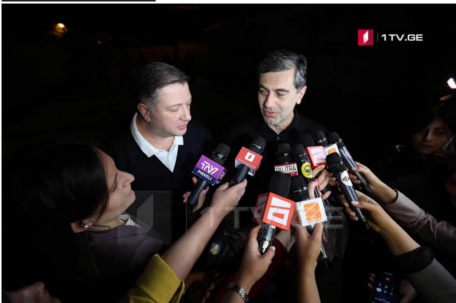
On May 15 th President Salome Zurbashvili pardoned Ugulava and Okruashvili 'to break the tension, not because they were political prisoners.'

The statement was issued by the press center of the United National Movement. The Georgian Dream and the opposi-