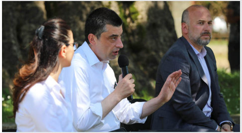
FULL STORY ON Page 2

Gakahria talked about the plans of opening up the economy.