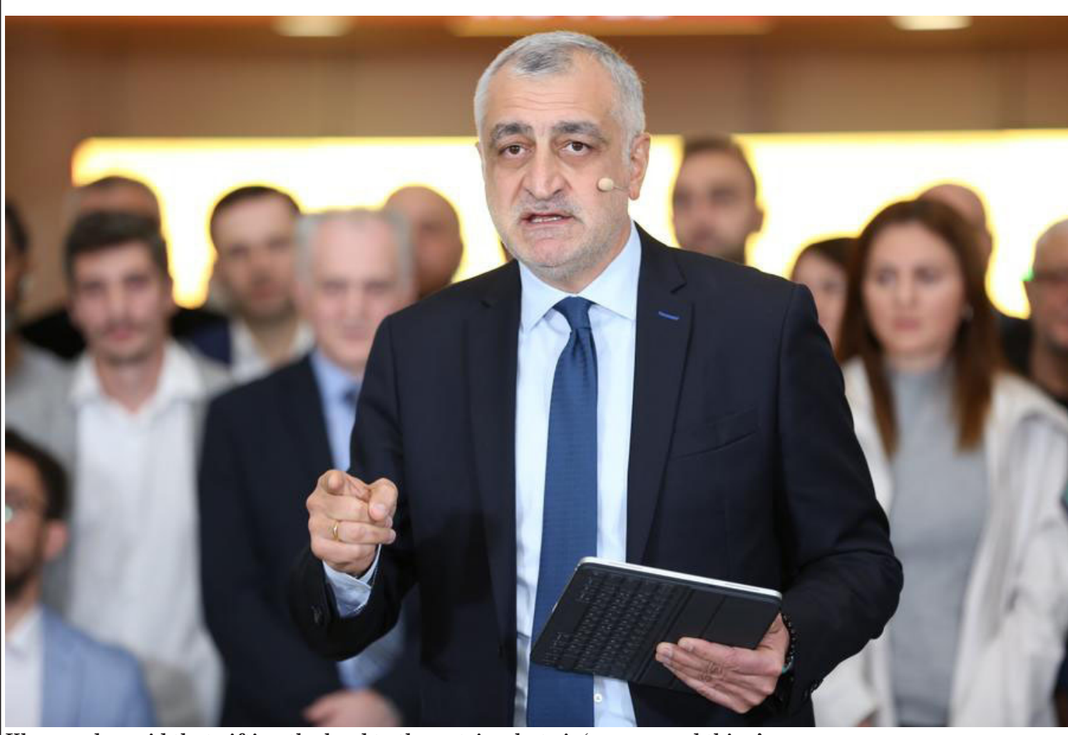
Khazaradze said that gifting the land to the patriarchate is 'a very good thing'