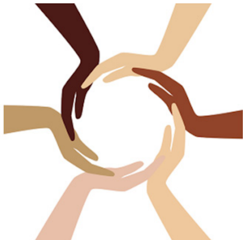
Racial discrimination issues intensifying in Georgia.

The agency has launched an investigation under Article 142, Part 3, Subparagraph A of the Criminal Code of Georgia.