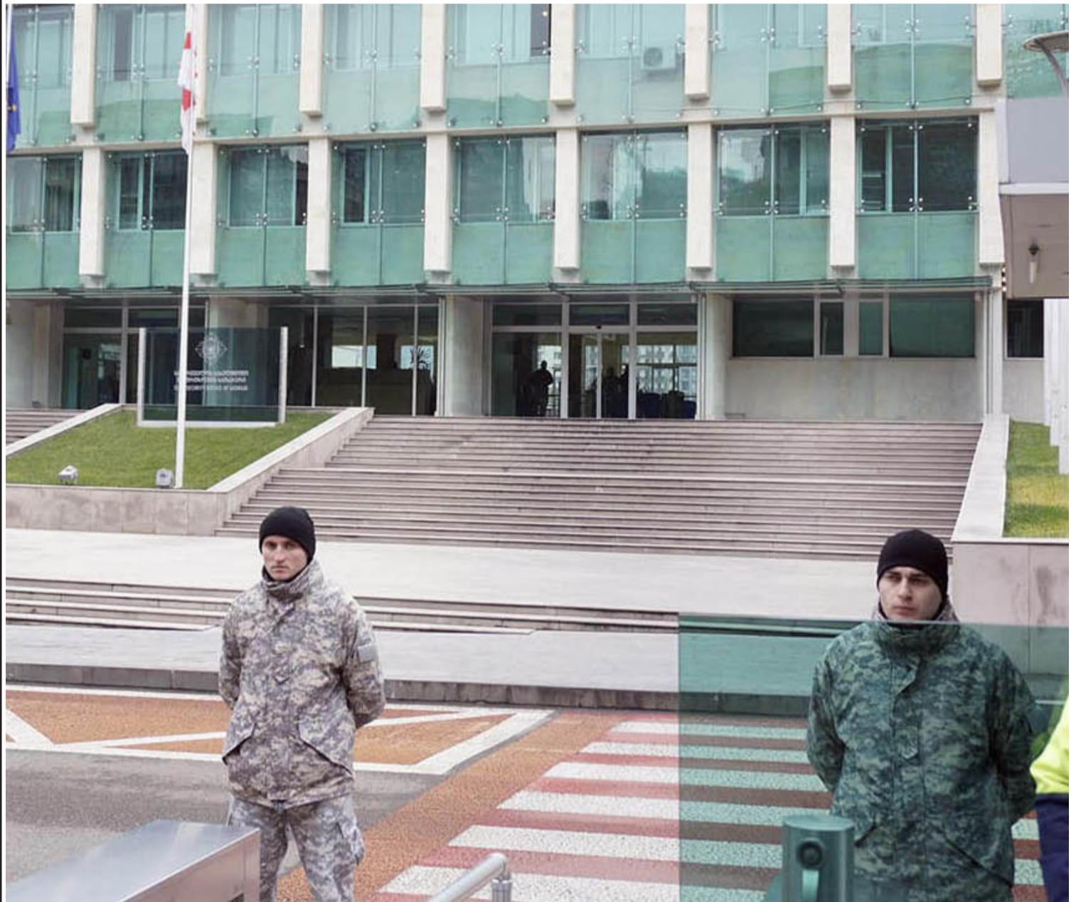
Statement by SSS.