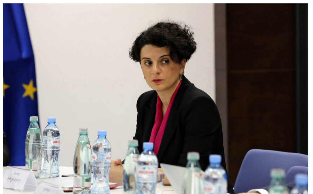
Head of the government administration, Natia Mezvrishvili, notes that Georgia has one of the most decent legislation in terms of child protection, worldwide.

As the statement notes, it is extremely important for them to ensure prompt and effective justice for juveniles. For this purpose, the Prosecutor's Office has developed a mechanism for the diversion of juveniles and the monitoring of criminal cases of juvenile offenders, within the framework of which the criminal cases are systematically studied and the analysis of the results of justice is presented to the public.