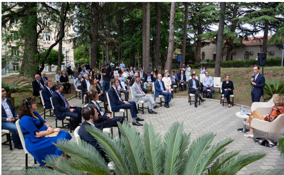
Attendants on the meeting held by the Ministry of Environmental protection and agriculture of Georgia.

Davitashvili stated, the issues of protecting the environment are one of the primary priorities of the government and the act of legislation (The Forest Codex), which was recently approved, is crucial and instills the principles of forest's sustainable management, which takes forest management to the whole new level. He also mentioned that the government has just adopted normative producer expanded duties, which is also a significant document and creates an opportunity of developing a circular economy- Green economy. In the current year, together with parliament, we will proceed to work on the initiatives and acts of legislations actively, in which the help of donor organisations is