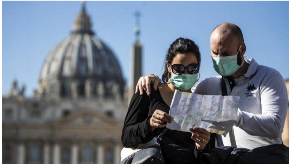
CNN: 2020 will be a catastrophic year for the tourism sector.