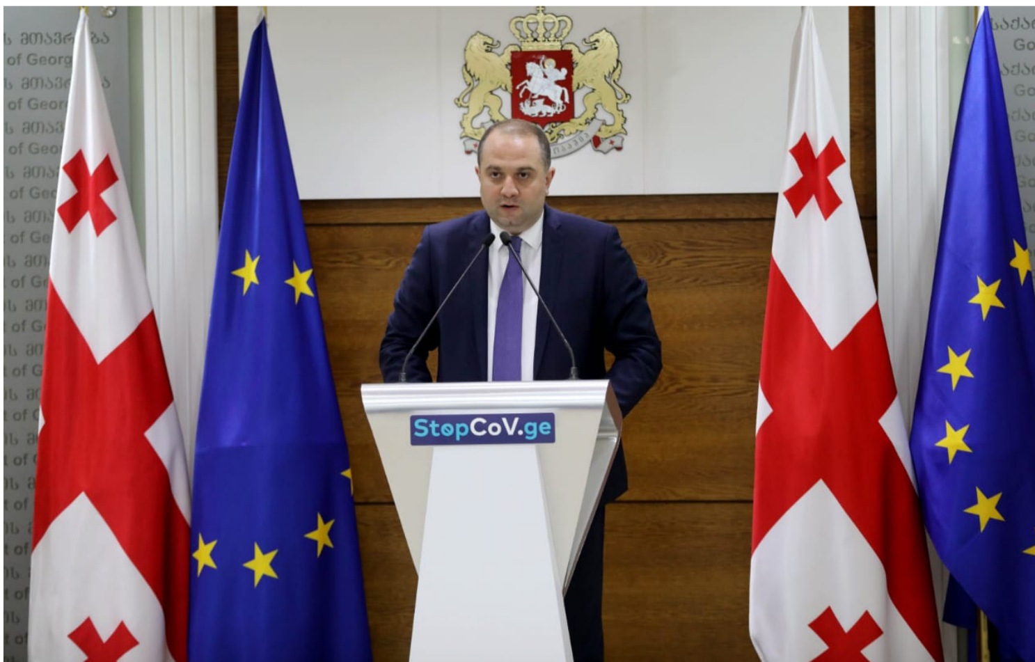
Some restrictions were lifted on May 23 rd .

All types of economic activities are permitted, with the following exceptions: serving customers on site in restaurants, bars, cafes, and dining facilities of any