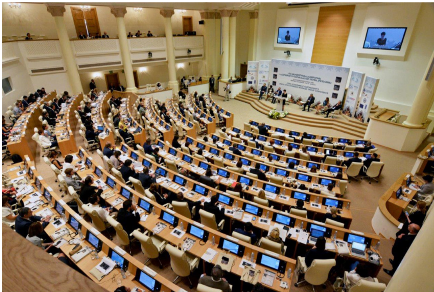
The Parliament of Georgia has approved the draft law with 81 votes.