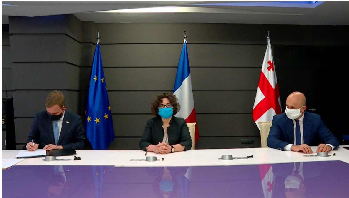
The loan ensures to provide financial and technical support to the reforms under way in Georgia

On May 22, 2020, this commitment came to fruition when the French Development Agency and the Georgian Ministry of Finance signed two loan agreements for a total of 190 million euros. The first loan agreement, amounting to 70 million euros, aims to continue supporting the Georgian health and social protection system with a particular effort on the measures taken in Georgia to fight against COVID19.