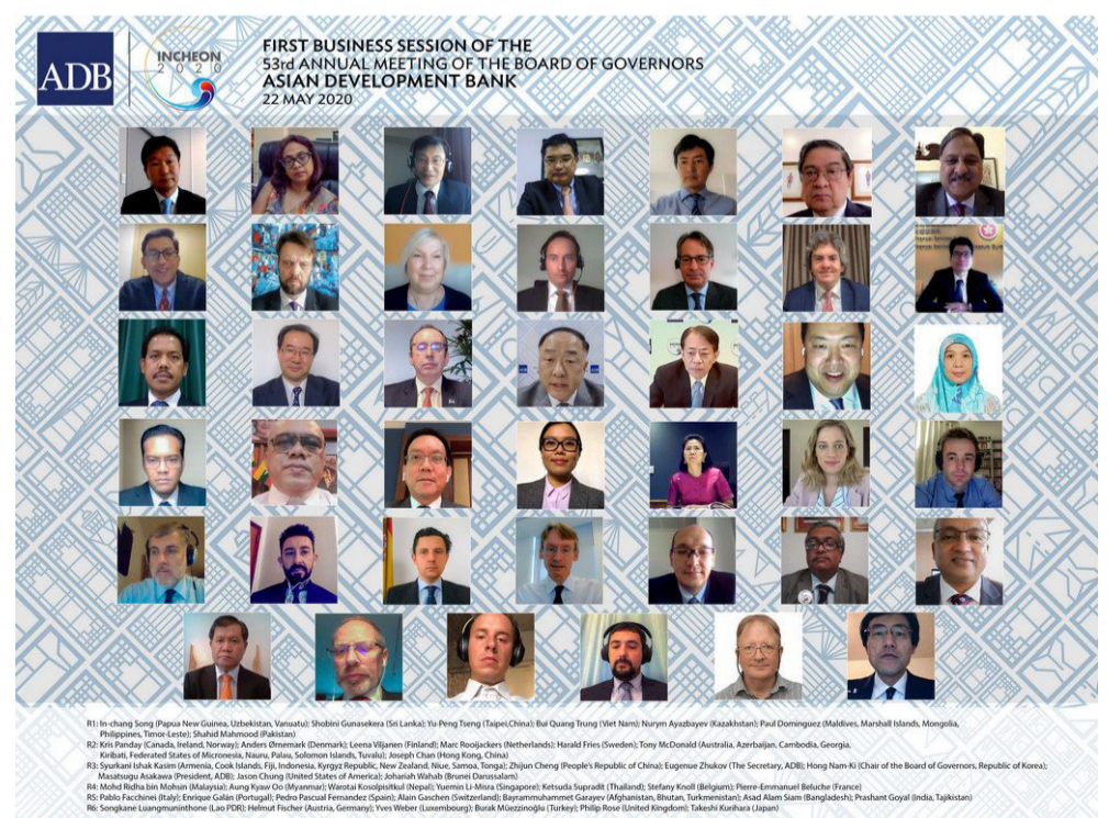
The approval came at the first stage of the 53rd Annual Meeting of the Board of Governors

ADB is committed to achieving a prosperous, inclusive, resilient, and sustainable Asia and the Pacific, while sustaining its efforts to eradicate extreme poverty. Established in 1966, it is owned by 68 members—49 from the region.