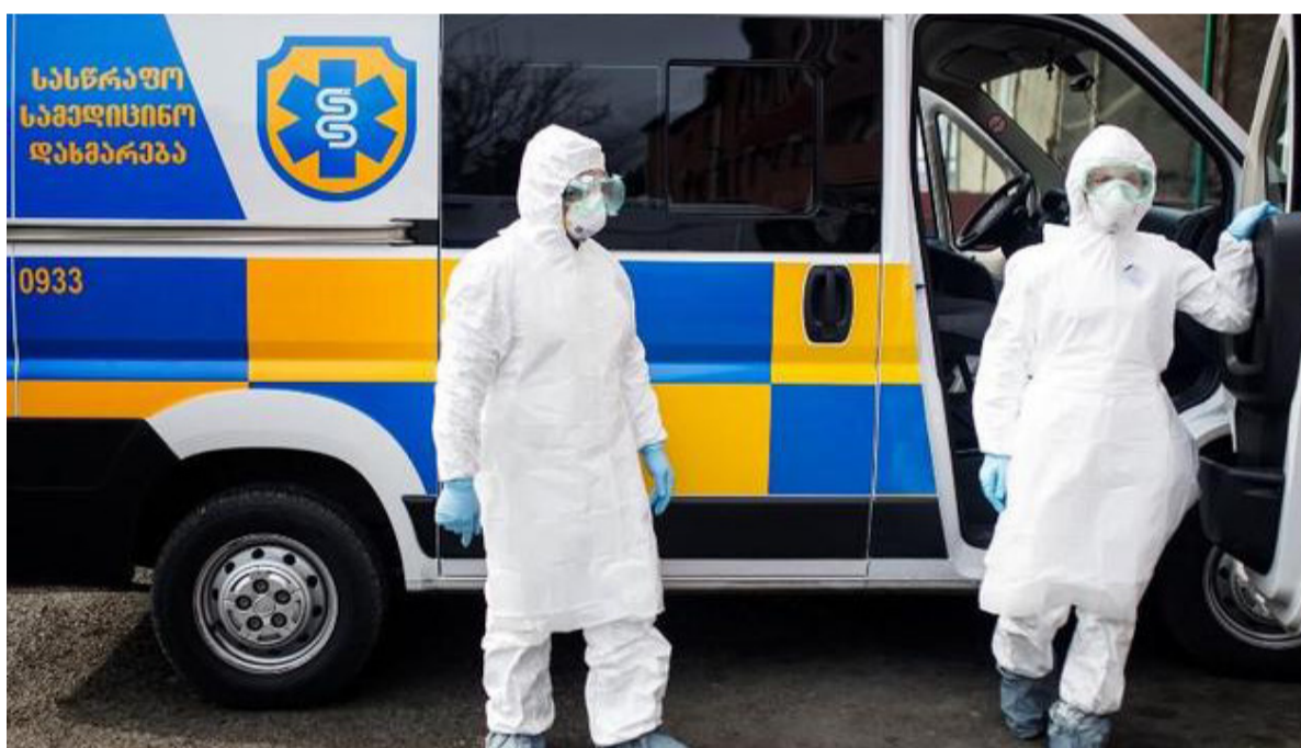
There are 730 reported cases of the virus in Georgia.

As of today, there are only 730 reported cases of the Novel coronavirus in Georgia. Out of the people infected, 522 have recovered and 12 have passed away.