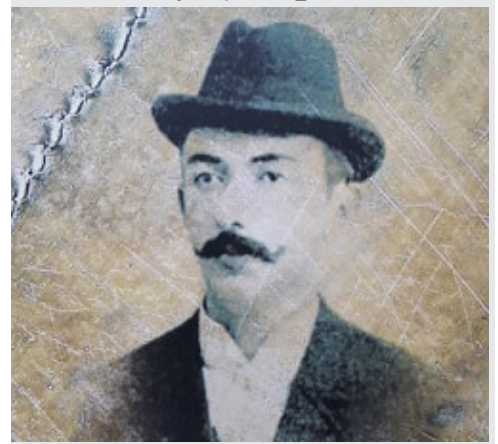
FULL STORY ON Page 4

Iakob Zubalashvili - Country of Liquid Sun