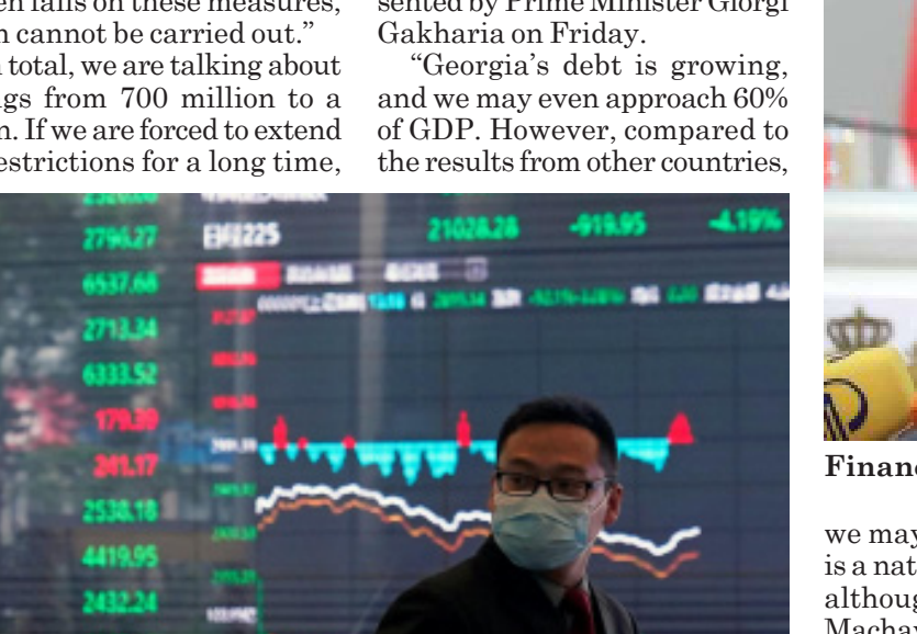
The novel coronavirus has originally spread from the Wuhan region of China