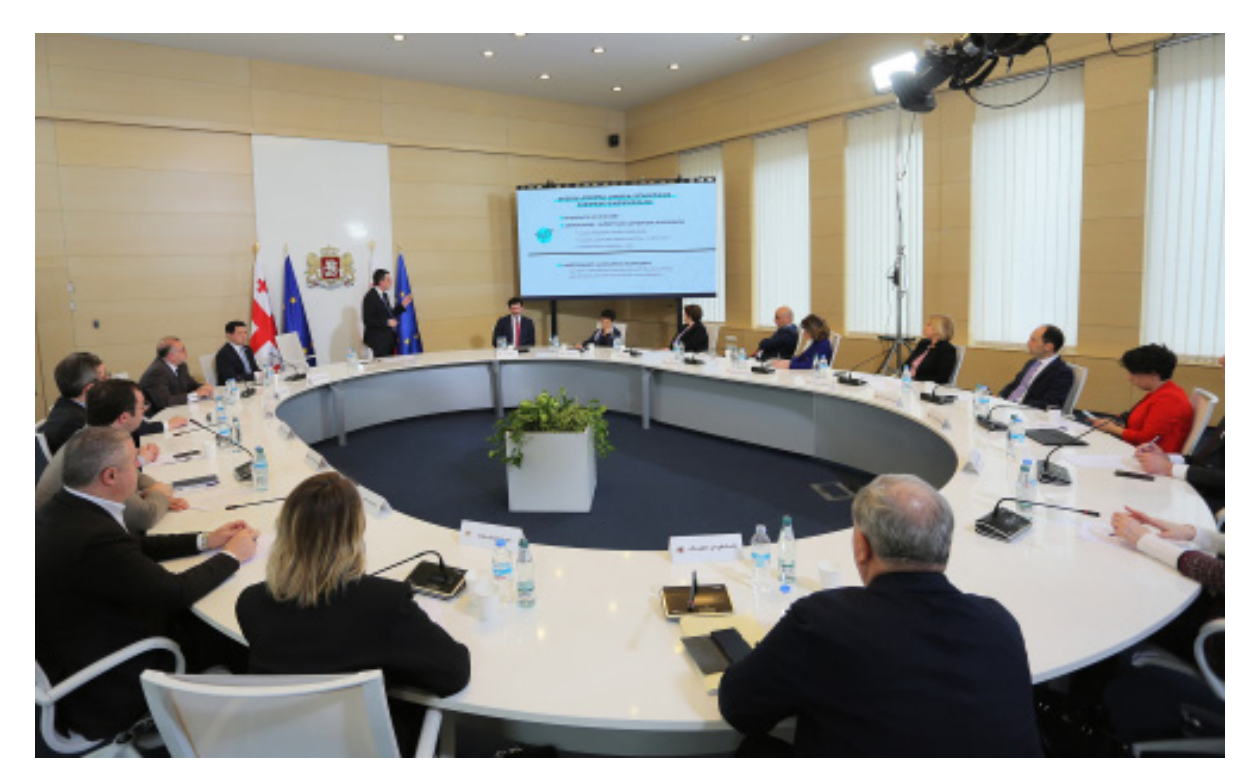
Other government representatives attended the presentation.

the second stage will start in about two weeks, and it will mostly affect construction, activities related to the supervision of construction, production of construction materials, car washes and car services in full, as well as repair of computers, personal and household goods and operation of recreational zones. At the third stage, trade restrictions will be lifted, the fourth stage will affect shopping