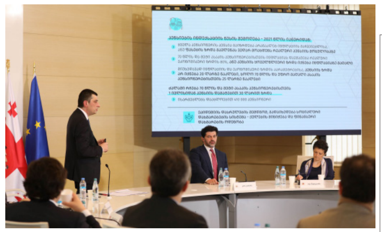
Gakharia said that there will be different stages for lifting the restrictions.