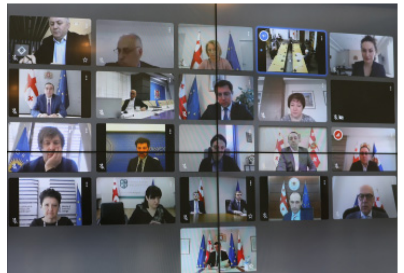
Gakharia said that 112 has become the first line of defense in the fight against COVID-19.

The situation in terms of food and medical supplies in the country was also discussed. Agricul-