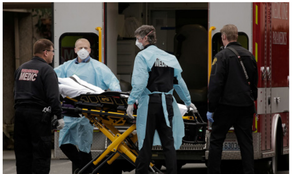
The US has reported the most cases of the virus.

were reported in the US, where the number of reported cases has already surpassed half a million. In Europe, Spain and Italy have reported the most Coronavirus cases.