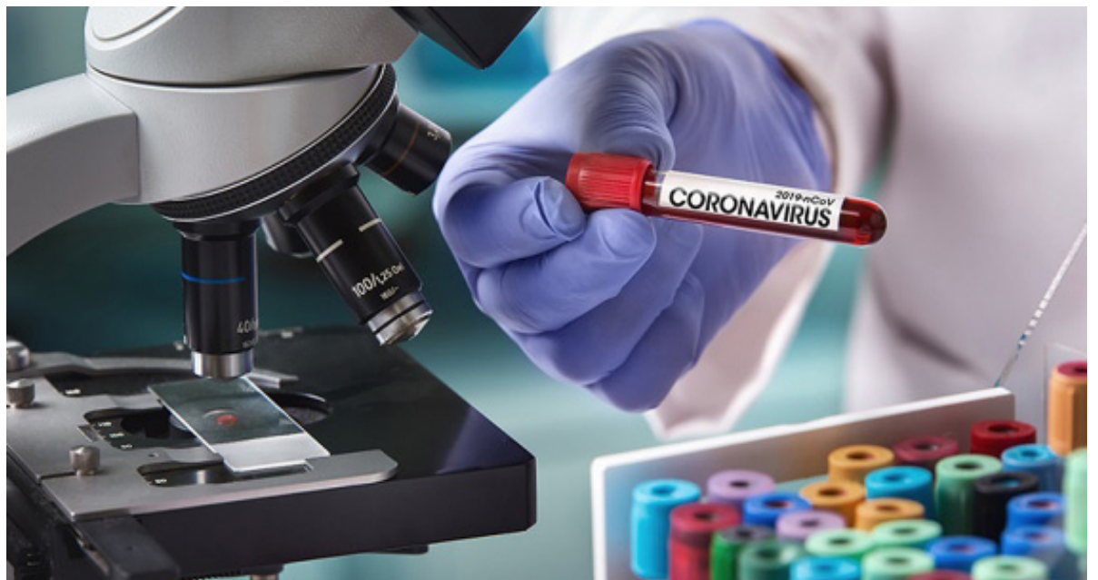
The virus has infected more than 250 people in Georgia.

The novel coronavirus has spread from the Wuhan region of China in December 2019. After China, the virus has spread around the world and managed to infect more than 1,8 million people worldwide.