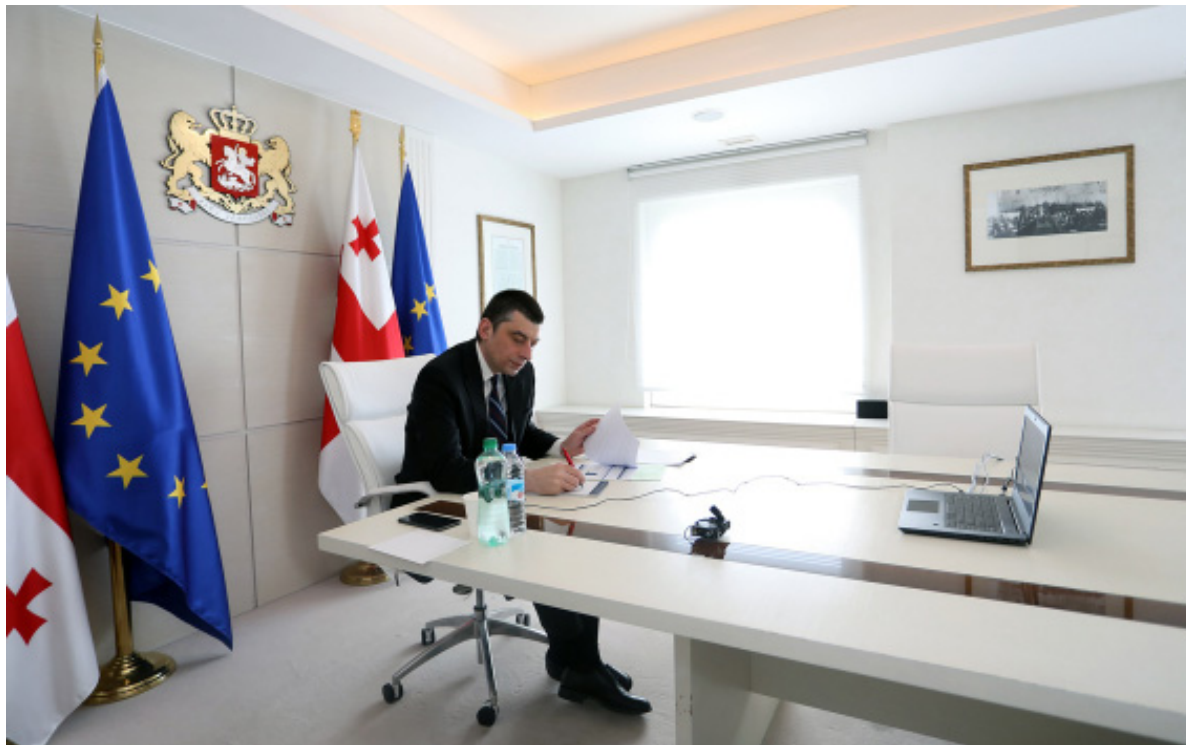
According to the Prime Minister, revealing the infected is of utmost importance.

ture and Environmental Protection Minister Levan Davitashvili noted that the country has no problems with food supply. It was noted that control measures (including the thermal screening of the population) are being actively implemented at the special checkpoints set up at the entrances to municipalities. It was also stated that it cannot be ruled out that the council will make similar decisions in connection with other cities, depending on the future development of the epidemiological situation and the recommendations of medical professionals.