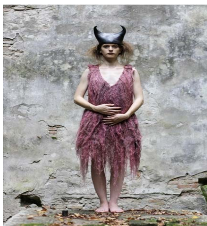
Figure 3: Mora : "The photograph of a pale model with black ceramic horns combined with a shaggy, almost blood-coloured dress gives me personally the impression of maliciousness with which my staging of the Mora with that model and photograph was complete. When I had become certain that I wanted to embody the Mora in a photograph, I started to look for an exceptionally pale girl and an adequate location, and with the make-up finish, the hairdo and the subsequently created photograph, I sealed forever in my own mind the Mora personage as such." Tajči Čekada vi

of snail shells I found, and small shells plaited into threads of hemp, which – as hemp is very light – float and appear as hair under water. The dress is ethereal and looks as though it is under water. The Rusalkas were water nymphs who were often described as mermaids, although not all of them, of course. In the majority of legends, the Rusalkas are pale, decrepit and evil. My Rusalka is joyful and sweet like the Rusalkas from the Danube, Sava and Dnepr Rivers. I gave the photograph the title The Betrothed Rusalka because of the girl's expression and appearance that indicated a bride-to-be and, truth to tell, she indeed got married very soon after the photograph was taken." Tajči Čekada