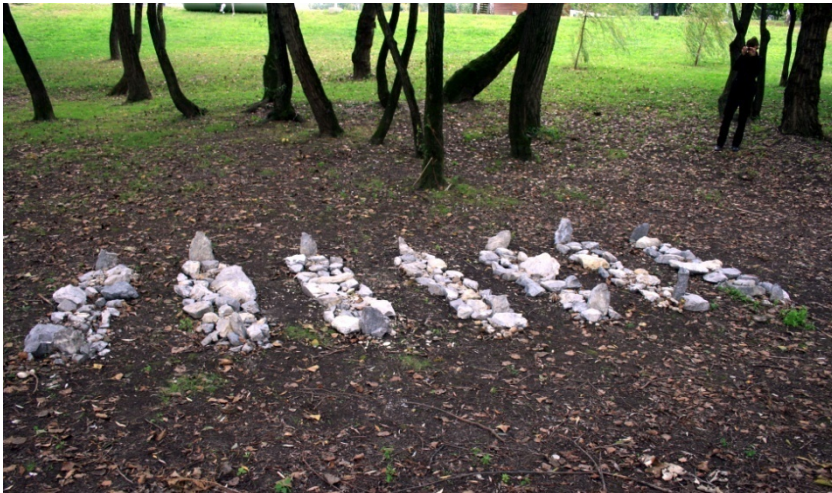
Figure: Josip Zanki and Bojan Gagić: Mirila , Zagrebi!EkoFestival, Bundeck Lake in Zagreb in 2008