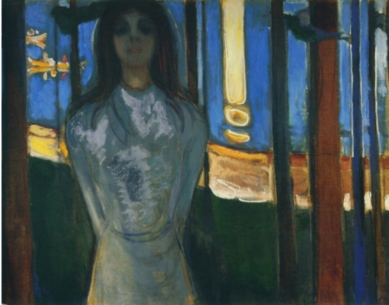
Fig. 3. Summer Night's Dream (the Voice) (1893), Munch-Museet, Oslo