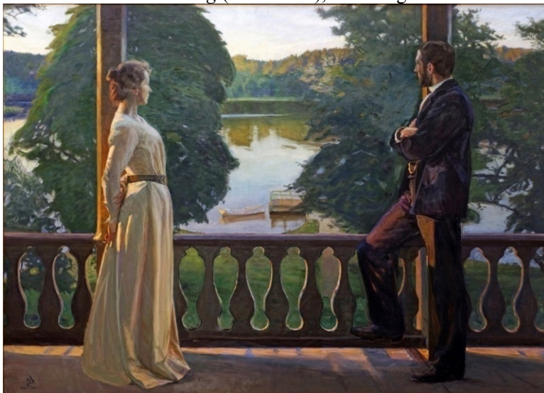
Fig. 1. Nordic Summer Evening (1899-1900), Göteborgs Konstmuseum

Consequently, Scandinavian artists gave new attention to indigenous traditions after their home coming. For them, Scandinavian landscape art evoked the blue mood of forest and water nocturnes, monumentalizing rugged places to show its history. Moreover, symbolism was found in the Nordic summer night with traditional overtones, as the night was attractive to those who searched for connecting inner psychological forces with nature's scheme, and to those who pursued to argue nationalism in the series of the seasons and its accompanying folk rituals. This magic and ephemeral night of sensuality fused shifting ideas of the self and state, reflecting the complexity of this moment in Scandinavian art. 1