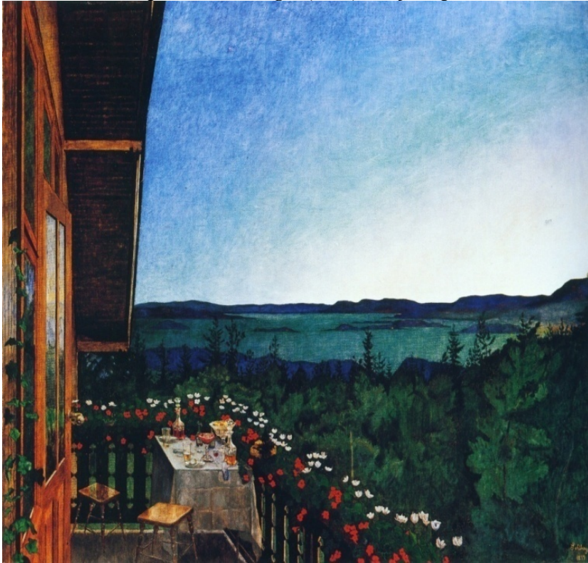
Fig. 5. Summer Night (1899), Nasjonalgalleriet, Oslo