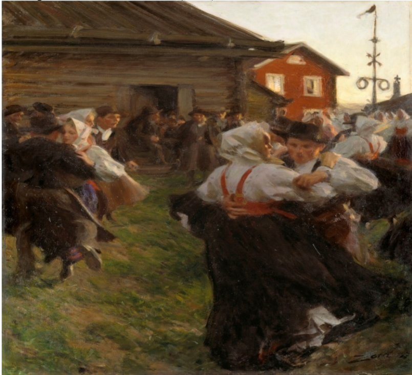
Fig. 2. Midsummer Dance (1897), Nationalmuseum, Stockholm