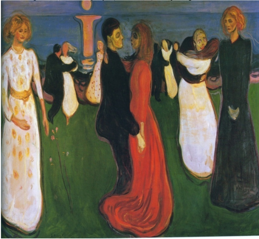
Fig. 4. The Dance of Life (1899-1900), Nasjonalgalleriet, Oslo