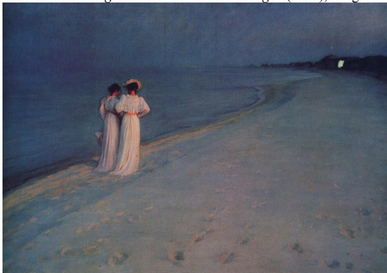
Fig. 6. Summer Evening on the South Beach at Skagen (1893), Skagen Museum