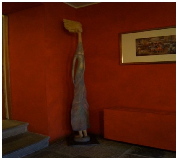
Fig. 7: Krivopeta in the restaurant Sale e pepe in Srednja/Stregna in Wenetia Giulia, Italy.

According to some descriptions the krivopete had long, messy hair and feet facing backwards; sometimes even their hands would be turned backwards. People also said that they have horse’s hooves. Legs facing backwards were also said to be the trait of the žalke , or the žalik žene , in Gailtal in Austrian Carinthia (Graber 1914: 53-56, No. 63). Similarly disfigured were allegedly Willeweis and Bilweis , the white fairies in Austrian Carinthia, as well as the Anguanas in Friuli in Italy.