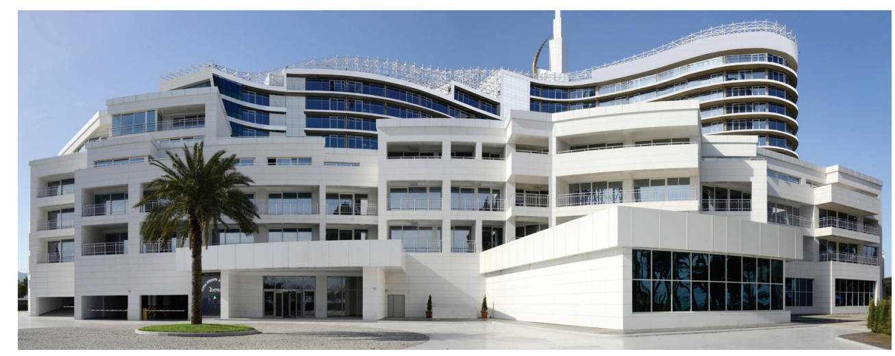
51 "Business" category apartments: the area is from 65 \text{ m}^2 to 170 \text{ m}^2 .